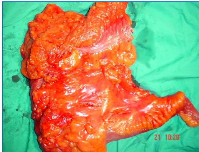
Figure 2: Pathology grading of colon cancer surgical resection: Mesocolic plane (“good” plane of surgery— intact mesocolon with a smooth peritoneal-lined surface)

Given all of these variables and the lack of data from prospective randomized studies with relevant clinical outcomes, CME should be regarded as investigational; therefore in our study three types of outcomes were of interest: The safety of CME, the quality of CME as well as oncological outcomes.