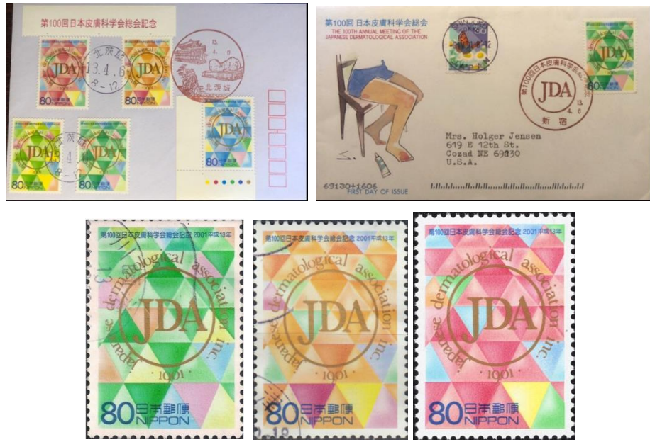
Figure 7. Philatelic materials of Japan dedicated to the Japanese Dermatological Association

Figure 7 shows a selection of Japanese philatelic materials (postage stamps (2001) and artistic stamped covers and first day covers (2001, 2003) dedicated to the Japanese Society of Dermatovenerologists [14].