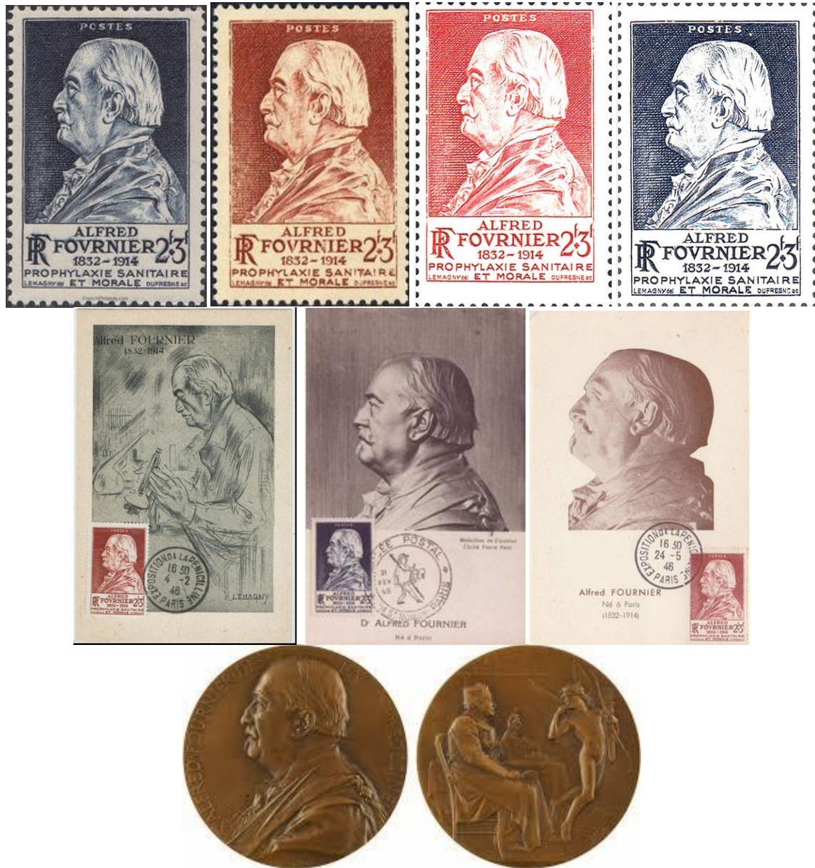
Figure 3. A selection of French collection materials dedicated to the famous French doctor and venereologist, Alfred Fournier

Figure 4 shows a postage stamp with an image of a famous Spanish dermatovenerologist, Juan Azua Suárez (1859-1922) [12].