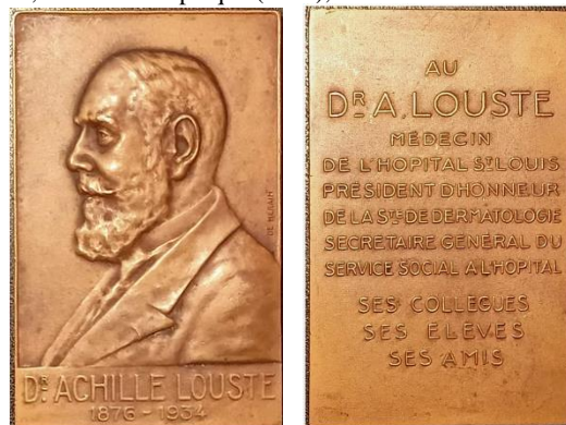
Figure 11D. Commemorative bronze tabletop plaque (1907) dedicated to Docteur Achille Louste

Next, in Figure 11 D, is a rectangular, commemorative, bronze table plaque (1907), dedicated to Docteur Achille Louste (1876-1934) [31].