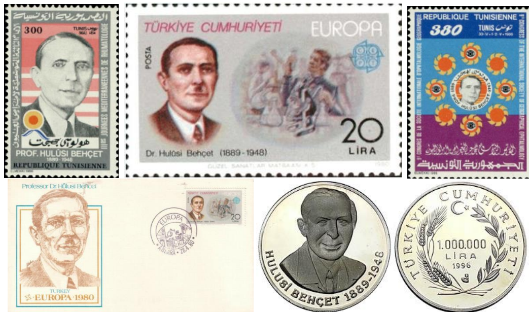
Figure 2. Collection materials dedicated to the famous Turkish dermatovenereologist, professor Hulusi Behcet, Türkiye

first 2 articles already mentioned by the author. We are talking about a practicing dermatovenereologist, and a famous Turkish/Arab scientist in this field of medicine, Professor Hulusi Behcet (1889-1948), Turkish [1, 2, 7-9, 35].