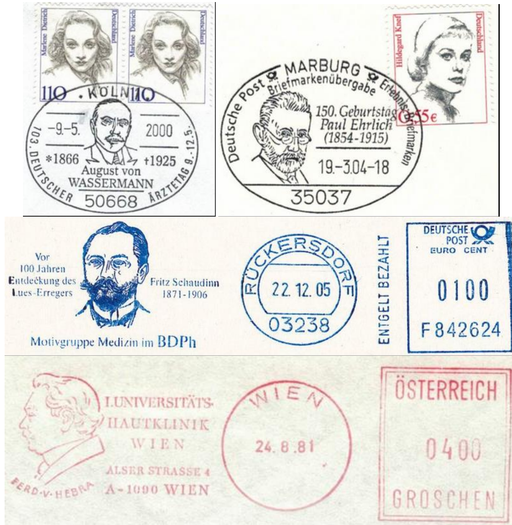
Figure 6: A selection of special cancellation postmarks dedicated to a number of dermatologists and venereologists who dealt with the problems of diagnosing and treating syphilis

Figure 7 shows a selection of Japanese philatelic materials (postage stamps (2001) and artistic stamped covers and first day covers (2001, 2003) dedicated to the Japanese Society of Dermatovenerologists [14].