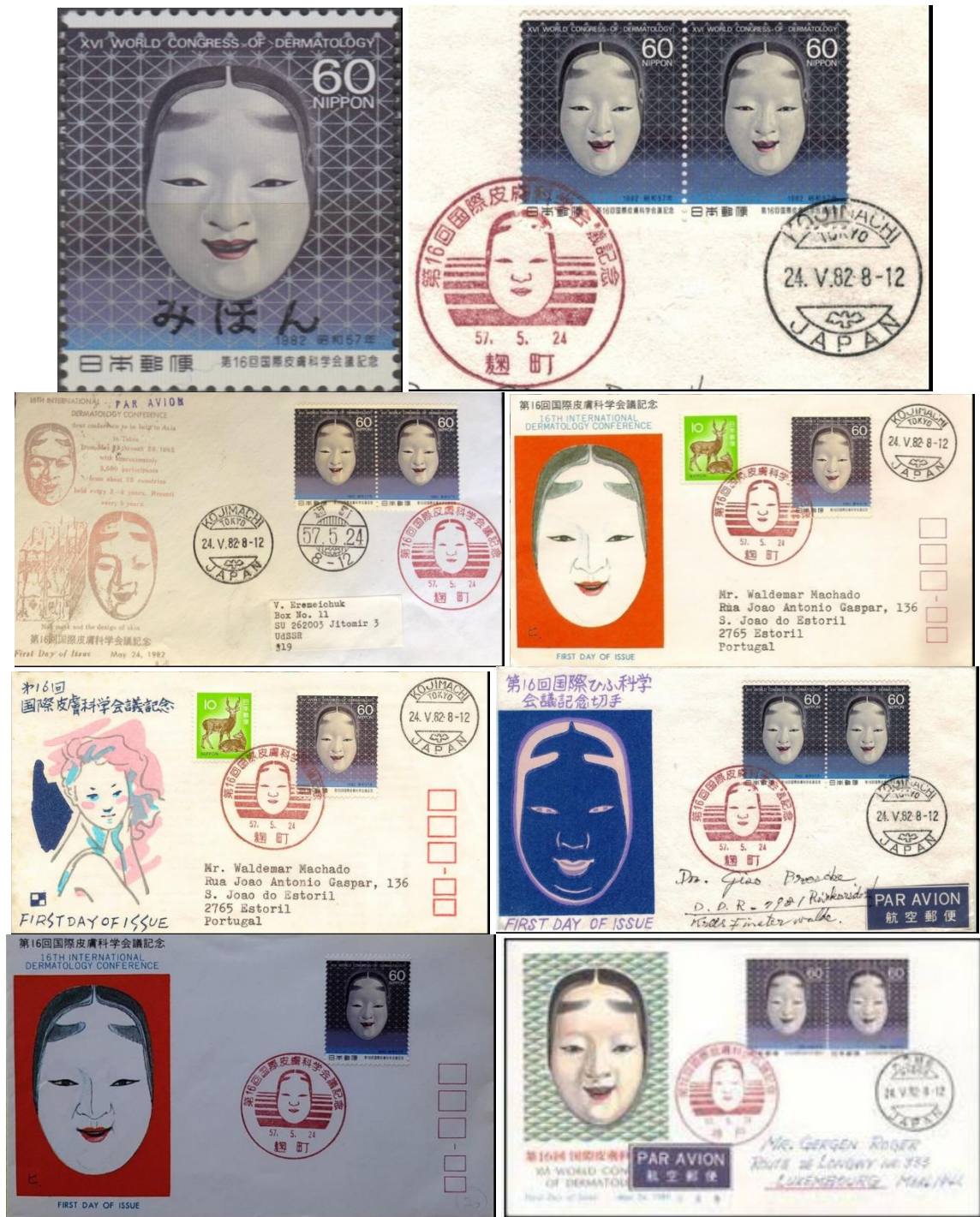
Figure 8. Philatelic materials of Japan dedicated to dermatology and cosmetology