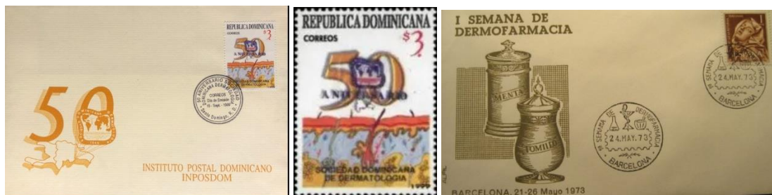
Figure 10. Philatelic materials dedicated to dermatology

dedicated to the International Congress on Dermatology held in this country. Also, in this same figure, an artistic stamped envelope from Spain (1973), dedicated to dermatological pharmacy [26].