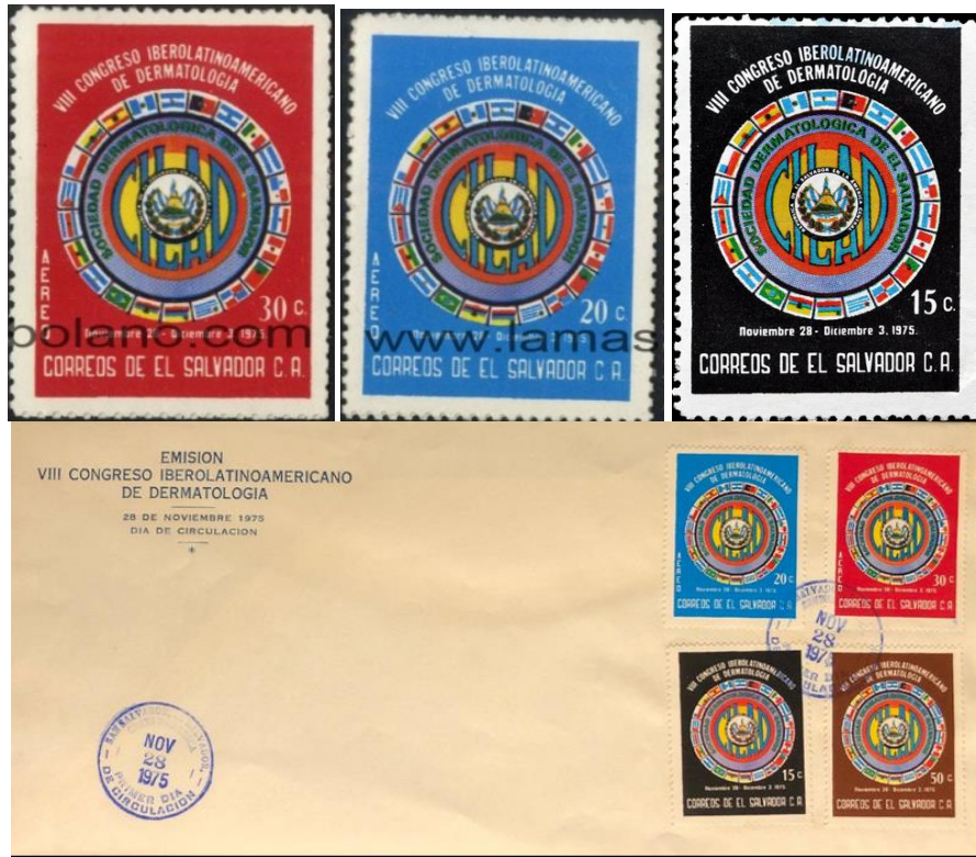
Figure 9. A selection of philatelic materials from El Salvador dedicated to the 8th Congress of Dermatologists of Latin American Countries

The following figure 10 shows a collection of philatelic materials from a number of countries (postage stamps and artistic stamped envelopes) dedicated to previously held Congresses on Dermatology [25]. This is a postage stamp and envelope from the Dominican Republic (1999),