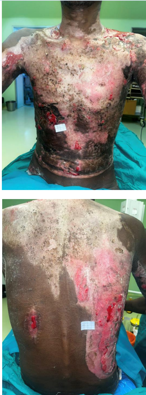
Figure 3: BJWAT Score 13 after treatment with skin grafting

The assessment tool was used by Plastic surgery trainees on this patient. Feedbacks were collected from them at the end of the study on the basis of which it was concluded whether B JWAT was helpful in their treatment protocol for their patients.