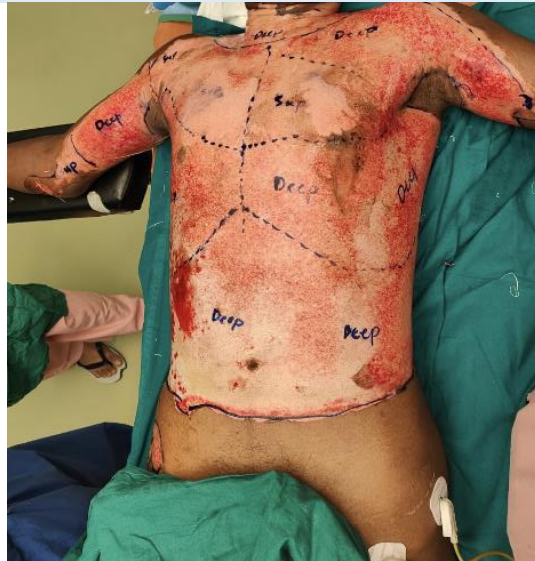
Figure 1- Wound with BJWAT Score 52 at admission