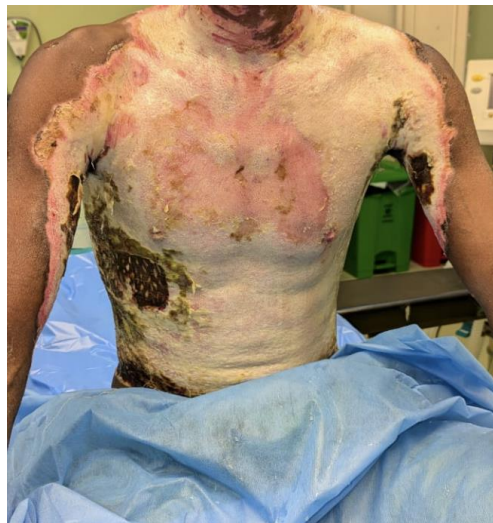
Figure 2- BJWAT Score 32 after treatment