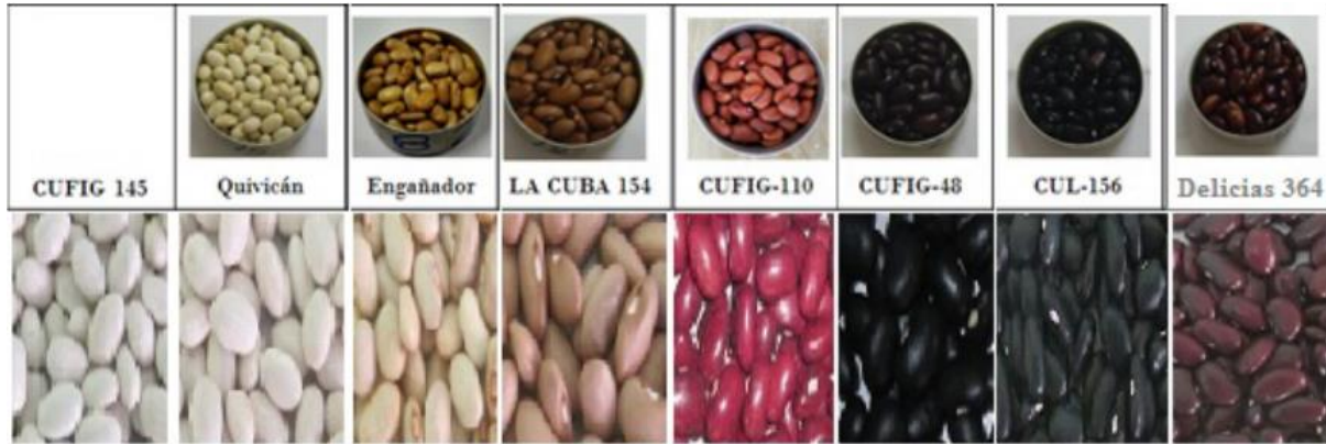
Figure 1: Bean varieties used in the study

The experiments were carried out in the Postharvest Biology and Technology laboratory of the Institute for Fundamental Research in Tropical Agriculture "Alejandro de Humboldt" (INIFAT). In the study, the conservation method used was storage in paper-covered envelopes at ambient temperature and relative moisture for 12 months and for this, the eight bean varieties shown in Figure 1 were used.