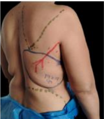
Figure 1.2: 1. Mastopexy bilateral pattern with a superior pedicle at the contralateral breast. 2. Latissimus dorsi muscle flap preoperative design.