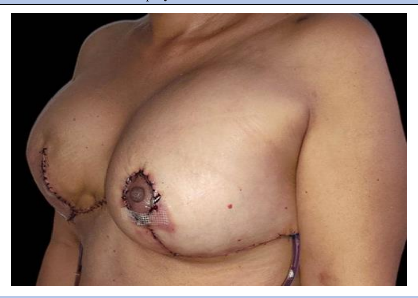
Figure 6: Result of the immediate right breast reconstruction through the latissimus dorsi muscle flap with breast implants and superior pedicle Mastopexy contralateral simetrization.