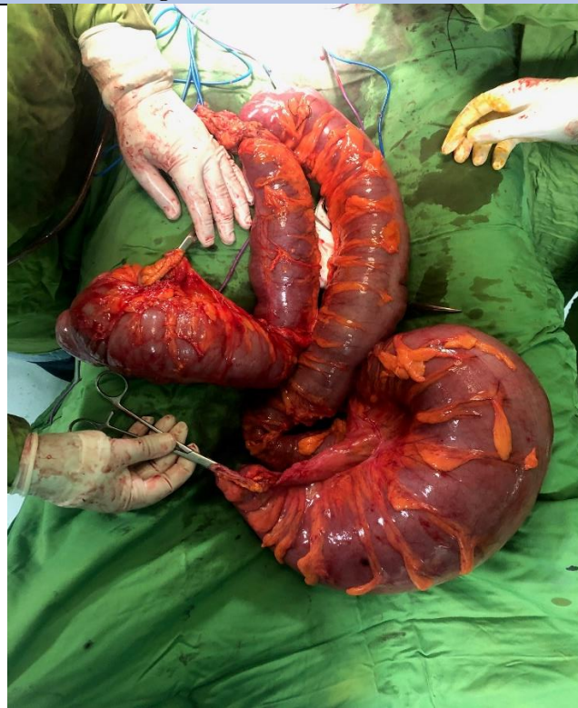
Figure 3: Total colectomy.