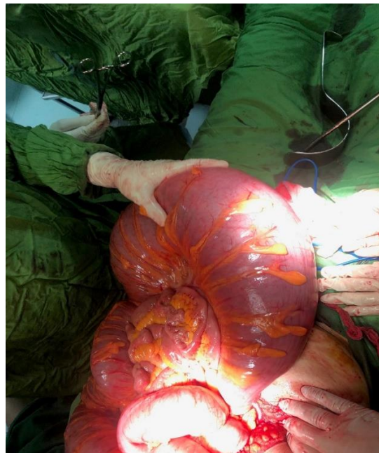
Figure1: cecal and transverse colon volvulus.

Our case was a 52 years old female with history of recurrent and transient abdominal distention for 10 days in every months. She referred to Surgery parts and we start examinations and lab data's. She has 6200/ml WBC, no fever, no nausea and no vomiting. She has good and healthy appearance and in abdominal examination she has distention synchronized in abdomen, no scar of surgery, no colorless and no tenderness. We perform a triple CT for her and we find 2 Simultaneous separated in cecal and transverse colon volvulus that in surgery we find them (figure1), with this information we programing a surgery for her. In Laparotomy we find transverse colon volvulus (figure 2) and we decide to do total colectomy (Figure 3). It shows she has 3 years Chronic Simultaneous separated triple large bowel volvulus ( Figure3 ).