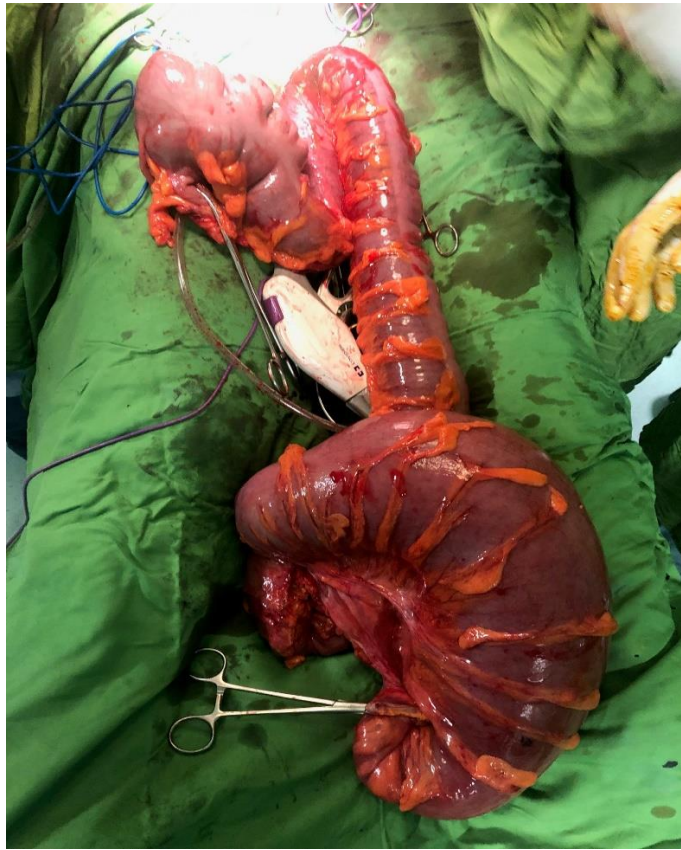
Figure 2: Transverse colon volvulus.