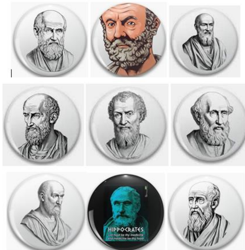
Figure 7. Hippocrates in the reflection of phaleristics, on thematic commemorative badges

Further, in conclusion of this article, in Figure 7, a small phaleristic collection is presented, consisting of 9 commemorative badges, thematically dedicated to Hippocrates [81].