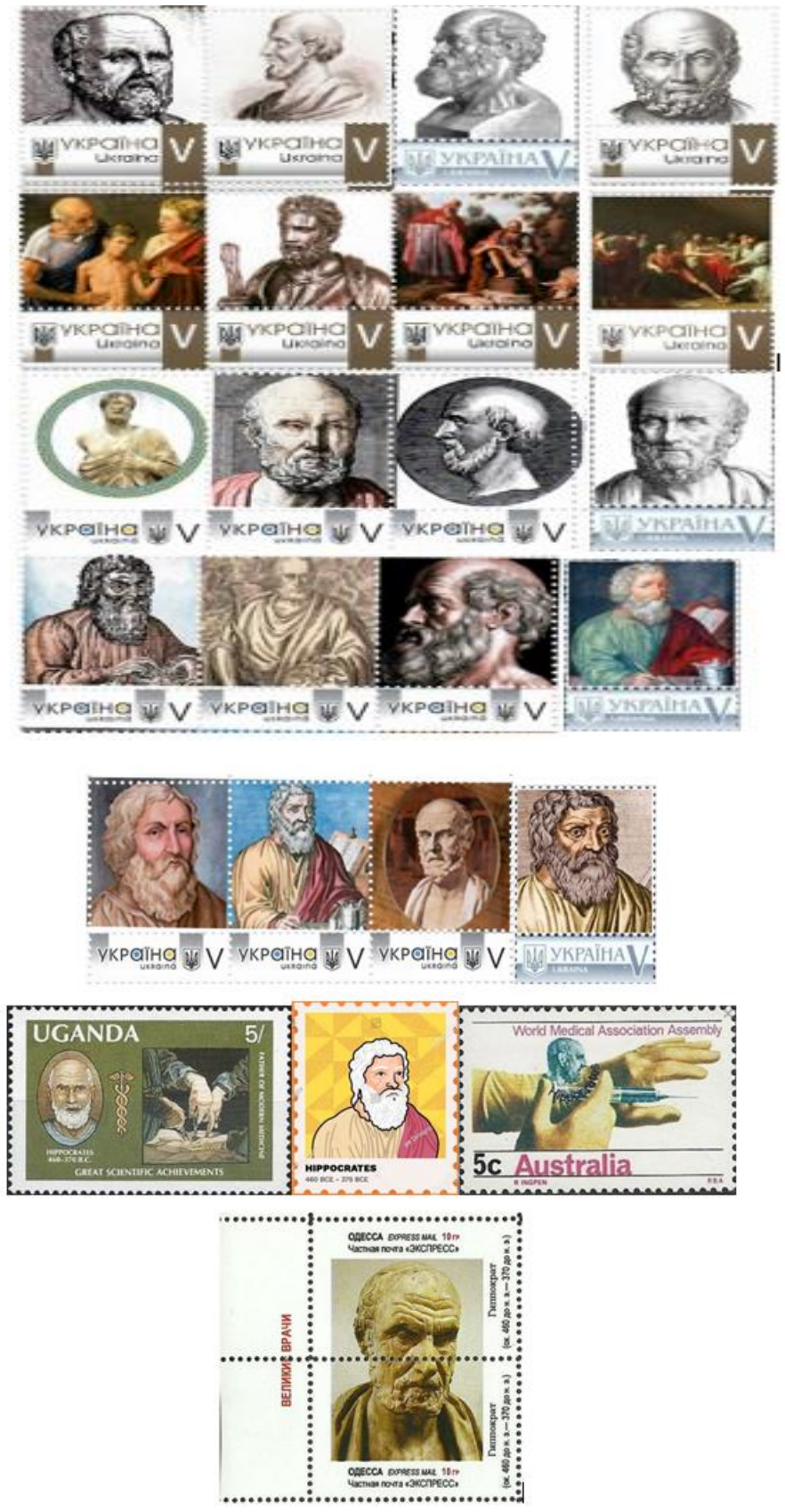
Figure 1. Postage stamps of the world dedicated to Hippocrates

Further, in thematic figure 2, a small selection of postal blocks (8 copies of their screenshot copies) dedicated to Hippocrates is presented, from such countries of the world as the Central African Republic, Moldova, Ukraine (4 copies of their screenshot copies), the Yemen Arab Republic [11, 18, 77].