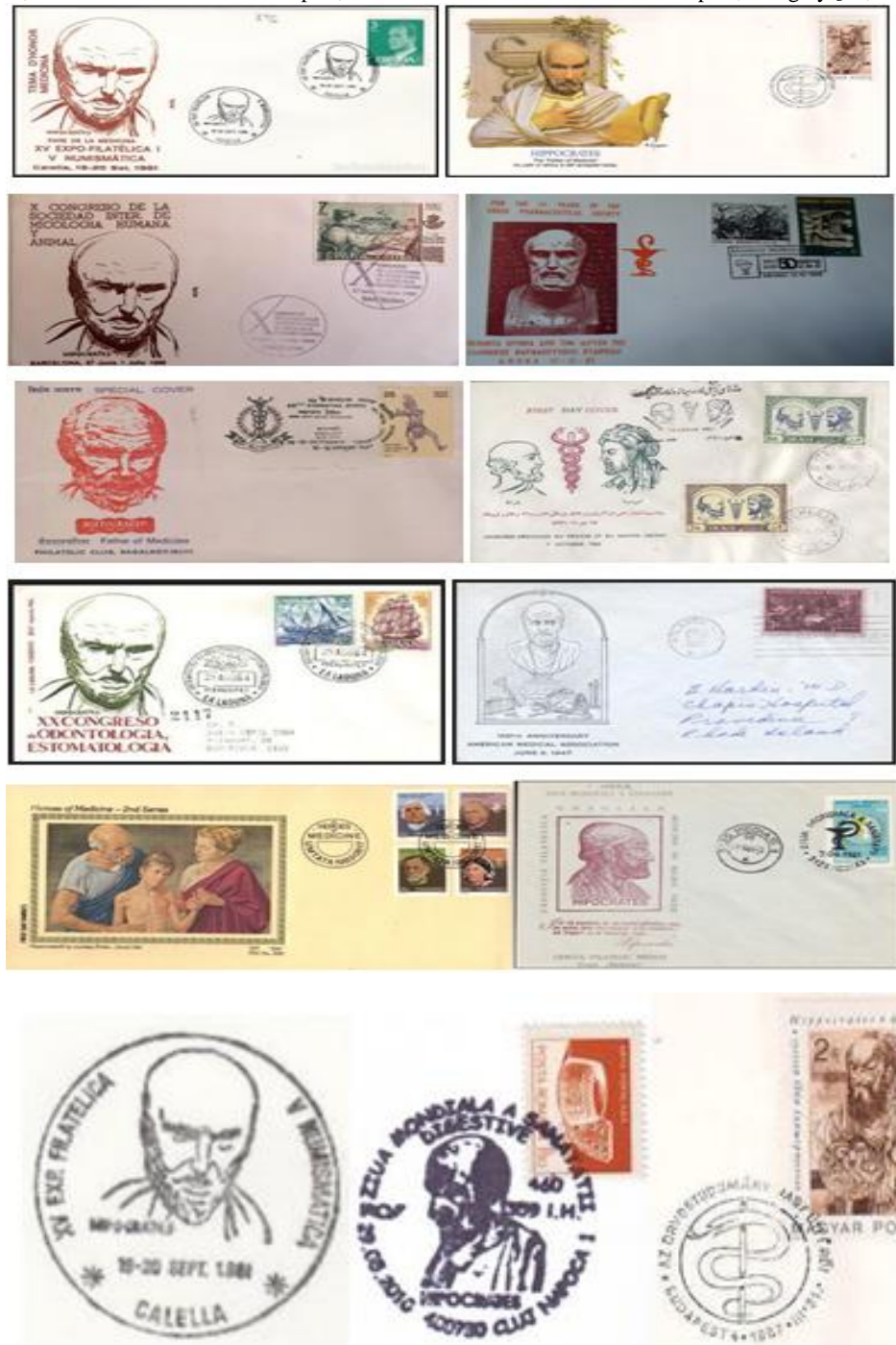
Figure 3. Postal envelopes and special cancellation postmarks dedicated to Hippocrates

Figure 3 shows a small selection of artistic stamped envelopes (10 copies) and thematic postmarks, special cancellation (3 copies), thematically dedicated to the genius of Hippocrates, in a total of 10 screenshot copies, from such countries of the world as Spain, Hungary [16, 19-25, 80].