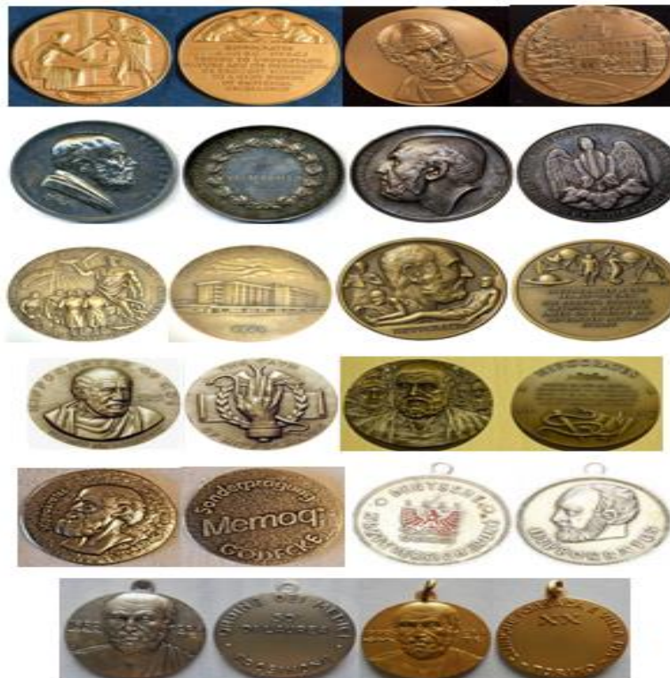
Figure 5. Commemorative medals dedicated to Hippocrates

years of their issue [29-75]. Presented are both traditional, round, commemorative table medals, and plaques - rectangular, commemorative medals dedicated to Hippocrates - Figure 5. Most of the presented examples, screenshot copies of commemorative, table medals, as well as two award, phaleristic medals, are presented both in the obverse (front, front part of the medals)