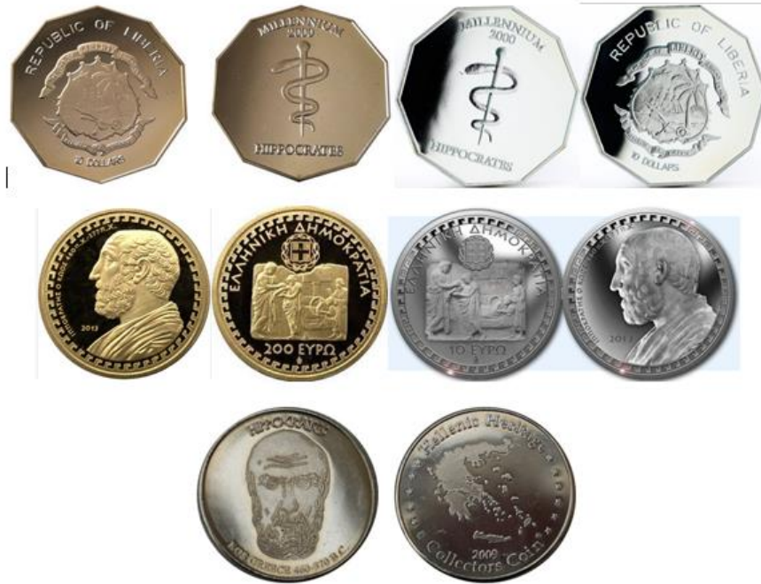
Figure 6. Commemorative coins dedicated to Hippocrates

of 10 and 200 euros; a coin of the Republic of Liberia (2000), with a face value of 10 local dollars; a coin of Italy [62-66].