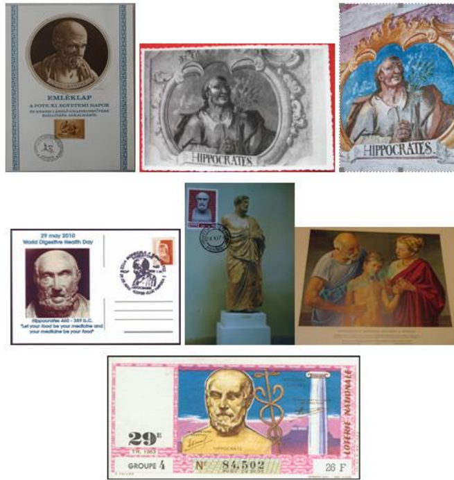
Figure 4. Collection of collection materials dedicated to Hippocrates

Figure 5 shows the largest, thematic, numismatic collection of screenshot copies of commemorative medals made of different metals (bronze, silver, gold and various alloys) and dedicated to the historical memory of Hippocrates, in total - 49 commemorative medals and 5 commemorative coins, from different countries of the world, topics and events, as well as