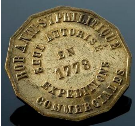
Figure 2: French token - "Antisyphilis"

Figure 2 shows a French anti-syphilis badge from the period 1778 [7].