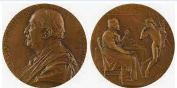
Figure 1: Commemorative table medals dedicated to famous scientists and dermatovenerologists

Figure 2 shows a French anti-syphilis badge from the period 1778 [7].