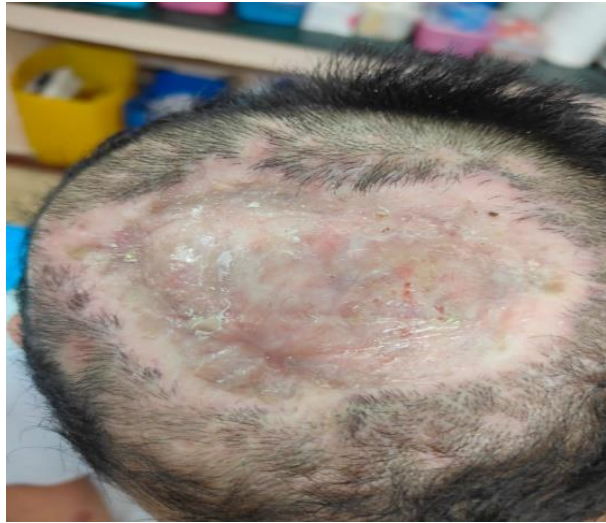
Figure 4: showing the result of the application of haemoglobin spray