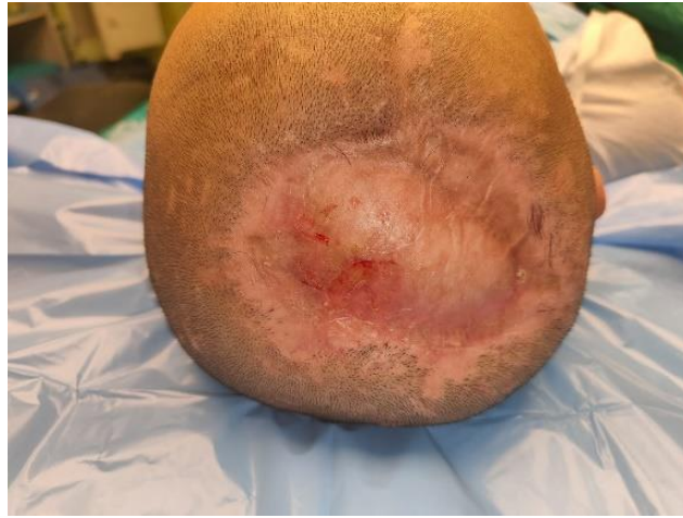
Figure 1: showing condition of raw area electrical burn at the time of presentation