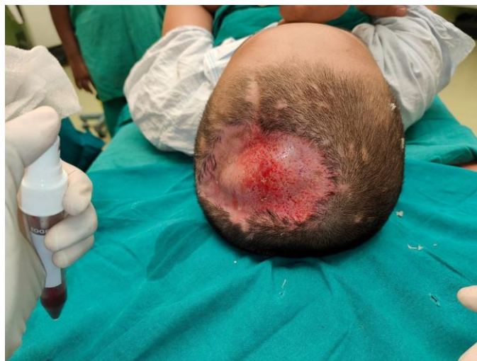
Figure 3: showing application of haemoglobin spray over the raw area.