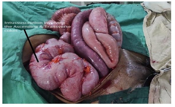
Figure 1: Intussusception insitu

The patient made an uneventful post-operative recovery and was discharged home on the 8th day after surgery. He's been followed up at the outpatient surgery clinic for 6-months and has remained clinically well.