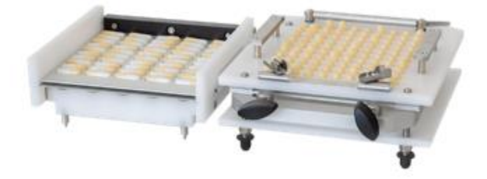
Figure 1: manual encapsulator, an expample of instrument used in galenic laboratory

"At the hospital, the pharmacist is constantly challenged to prepare extemporaneous solutions ES from tablets, capsules or drug powder for patients unable to swallow, Like as pediatric, elderly and patients that use nasoenteric and nasogastric tubes. The preparation of extemporaneous solutions ES from capsules, tablets and drug powder requires stability studies analysis"