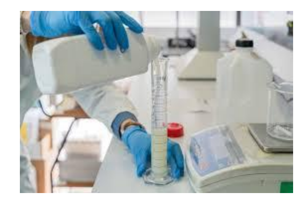
Figure n 2: galenic laboratory, an example of solution preparation by the pharmacist