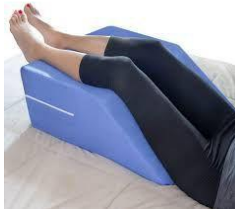
Photo 8. An example that will create pes equinus varus – striker foot, because the stability must be achieve through an plantar flexion as part of the extension of one or two legs to create stability. This is example, what fear for decubitus can do and that this will create that nasty foot that we see in photo 7. The prevention of pressure score, in this case the heel area and the striker foot are both important priority to hold the quality of life as high as possible. And that are both elements that are important for the quality of life. And both together is possible !

Only an good support/pressure can catch the plantar flexion and bring the foot back in the good position and that support must be use for this person for prevention of his striker foot.