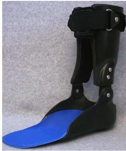
Photo 12. An example of an AFO that will take care of the length of the calf muscle through the possibility of a hinge that allow the person to walk with great step length and so stretch the calf muscle and the not-contractile elements and this is important for the walking pattern but also to prevent a striker foot on a later stage that than must be treated with redressing casting or even an operation of the Achilles tendon.