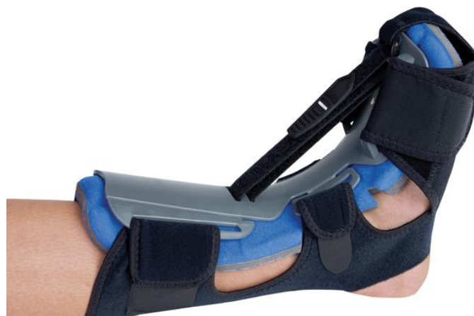
Photo 4. One of the many devices that are there to prevent the stroker foot but is this the right one?

And here is the problem, because that means that this approach asked for an pillow, orthosis even an striker foot device that take care that after the push the foot is going back in the correct position and that the tone decrease.