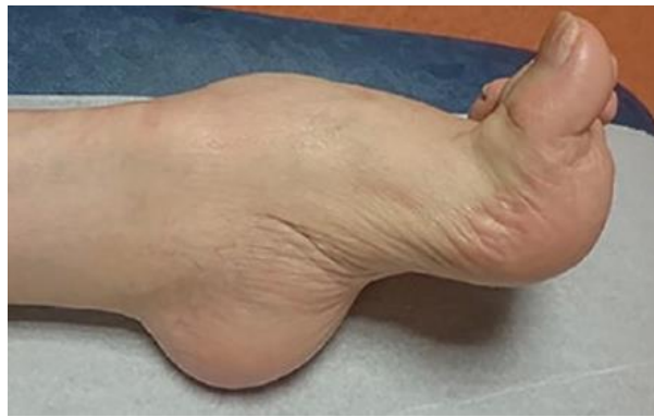
Photo 7. Often is this the end-position that what we see on photo 7 and that means that also sitting in an chair isn't nice. That amount of tension in the foot is an task for everyone to prevent it go the other way!!

The prevention of the striker foot is also an job, that is for every striker foot different, but the fact that people with less selectivity through an neurological disease must use an extension synergy is the reason that there the striker foot occur.