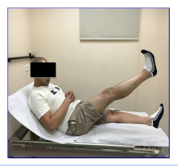
Figure 7: Postoperative full extension 3 months.

The graft was peroneus longus tendon auto-graft, fixed by inter ferance biodegradable screws on tibial side and end button on femor side. Postoperative laxity tests and pivot shift were done.