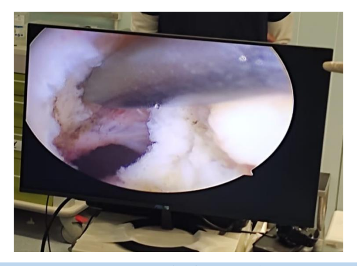
Figure 3: Creation femur tunnel.

Lateral Intercondylar and Bifurcate Ridges When there are no remnants of the native ACL present, the underlying bony morphology of the ACL femoral attachment site can provide useful anatomic landmarks to assist with anatomic ACL femoral tunnel placement. the tunnel center is precisely positioned between the lateral intercondylar ridge and the posterior articular margin. This alignment, combined with a distance of approximately 2.5 mm plus the planned tunnel radius from the posterior articular cartilage, centers the tunnel directly over the lateral bifurcate ridge.