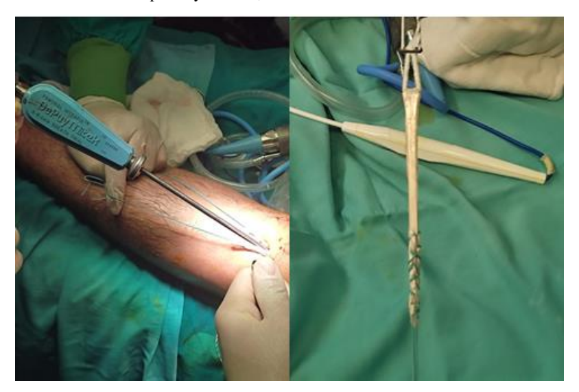
Figure 5: Graft passage and fixation.

On the femoral side, an EndoButton is utilized for suspensory fixation, while a Bio bioabsorbable interference screw is employed on the tibial side.