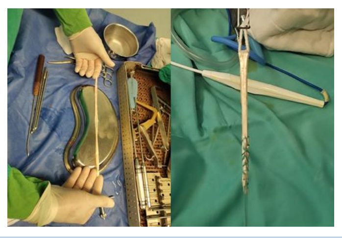
Figure 2: Graft preparation.

With the PLT harvested, the surgical team proceeds to prepare the tendon graft for ACL reconstruction. Any excess soft tissue is trimmed, and the graft is carefully cleansed to remove debris and blood clots. The PLT is then sized appropriately based on preoperative measurements and intraoperative assessment. Suturing of the PLT may be performed using high-strength, non-absorbable sutures to ensure secure fixation and stability of the graft. Care is taken to maintain proper tension and alignment throughout the suturing process, minimizing the risk of graft misalignment or laxity.