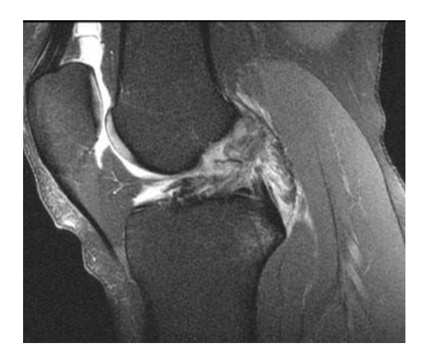
Figure 6: Pre-operative MRI.

The graft was peroneus longus tendon auto-graft, fixed by inter ferance biodegradable screws on tibial side and end button on femor side. Postoperative laxity tests and pivot shift were done.