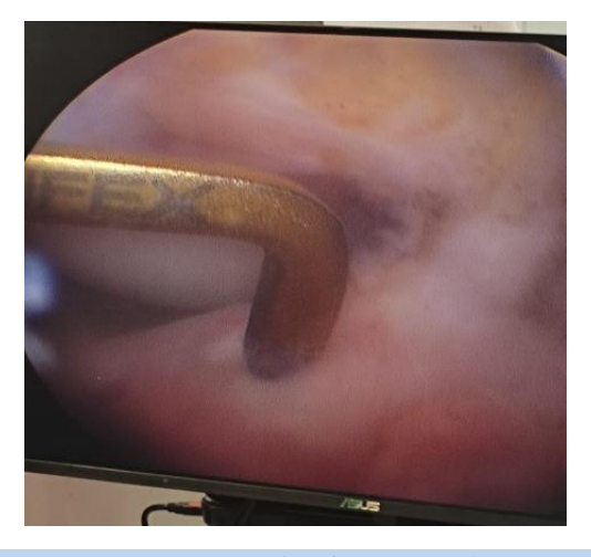
Figure 4: Creation femur tunnel.

10 mm anterior to the posterior cruciate ligament insertion with the center of the tunnel ideally being just posterior and medial to the anterior horn of the lateral meniscus. This allows for an anatomic recreation of the tibial footprint of the ACL.