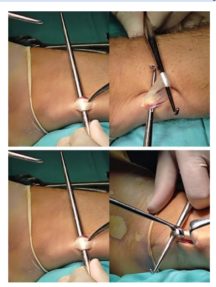
Figure 1: Incision and graft harvesting and discrimination of proneus Longus tendon.

Special attention is paid to identifying the course of the PLT as it courses distally along the lateral aspect of the leg. Once adequately exposed, the PLT is carefully dissected free from its surrounding sheath, taking care to maintain its structural integrity and minimize trauma to the tendon fibers.