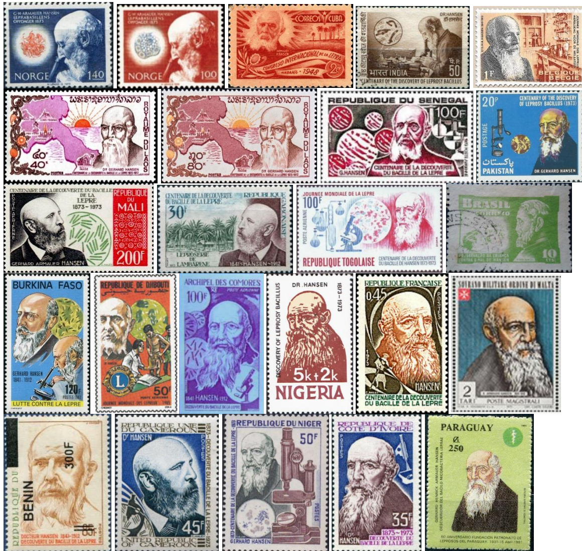
Figure 1. Gerhard Hansen on world postage stamps

Also, there is a number of first day postal envelopes - 11 copies, with postage stamps, images and special cancellation seals, dedicated to the Norwegian scientist who devoted his life to the fight against leprosy. Some of these envelopes, issued by the postal departments of Laos, India, the Republic of Dahomey, France, mainly for the 100th anniversary of the discovery of the causative agent of leprosy (leprosy), are presented in Fig. 2 [5; 6; 7; 8].