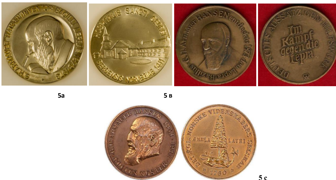
Figure 5a-c: Commemorative medals issued in honor of Gerhard Hansen

In Fig. 5 b, a German copper commemorative medal is presented, issued by the German Association for the Fight against Leprosy (leprosy), in honor of the 100th anniversary of the scientist’s discovery of the causative agent of leprosy, with a portrait of the scientist on its obverse, and an inscription in German on the reverse of the medal “In the fight against leprosy (leprosy)” [11]. In Fig. 5 c, presents a Norwegian commemorative bronze medal. The obverse features a portrait of the scientist in profile, facing left, his full name and surname, and the dates of his life “Gerhard Henrik Armauer Hansen (1841-1912)” [12]. On the reverse of the medal there is a small seal of the Royal Norwegian Scientific Society and an inscription about this in Norwegian “Det lille seglet til Det Kongelige Norske Videnskabers Selskab” [12; 13].