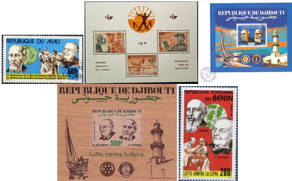
Figure 4: Philatelic materials from a number of countries dedicated to the heroes of the fight against leprosy

on the postal block, a portrait of G. Hansen is presented together with a portrait of the famous Father Damian, who devoted his life to serving people with leprosy in the leper colony of Molokai, on the Hawaiian Islands. These philatelic materials are presented in Fig. 4 [5; 6; 7].