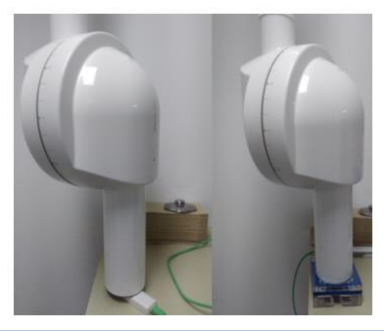
Figure 1. Montajes experimental para the ace medidas of parameters of exhibition (quierda) y calidad of imagen in 25 % of the bone values of K have more violas estan more dispersed team intraoral (derecha).