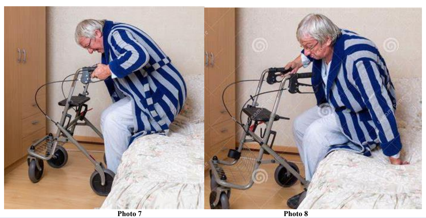
Photo 7 and 8: Regrettable still today have people the idea that the rollator frame can be useful for standing up, that is an utopia. When the power in the legs are too less to get to stand than will the rollator frame cannot contribute, because the handles are too high and inhibit an good trunk movement to the front. The solution what this gentlemen let us see (photo 8) is an solution in which the burden on the legs and the technique of the trunk (Vorlage) improve but the whole situation isn't good for an person that need an rollator to walk in his home.