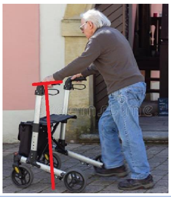
Photo 2: Seeing this gentlemen walk with this walker give everyone the impression that this isn't easy. Is this through the position of the handles what makes support difficult or/and stand the handles to high. Further are the back wheel far to the back what give the problem to walk with an broad walking pattern. The vector give an load before the back wheels but support on it isn't easy. An example that the walking aid makes things difficult and now he has some capacity in reserve and can walk with it outside but will "learn" an wrong attitude and walking pattern and the possibilities are limited faster for him to participate with the daily live outside his home and that is an pity. An clear example that when support is necessary that the handles must makes this easy!