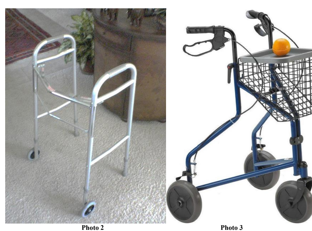
Photo 2 and 3: Walking with the rollator frame on photo 2 asked for an light lift of the back part to drive with the front wheels and that means that support isn't possible. The rollator frame on photo 3 is less stable certainly when people walk in an slow curve, but when turning is necessary around the axis than is this type better through the minimal turning circle. But this turning aspect must be done by both types (photo 1 and 3) with an support on the handles. By walking aid on photo 2 is turning and support almost impossible.

There are also rollator frames with three wheels (photo 3) or with only two wheels (photo 2) on the front but that types will asked more of the dexterity of the person that the other two