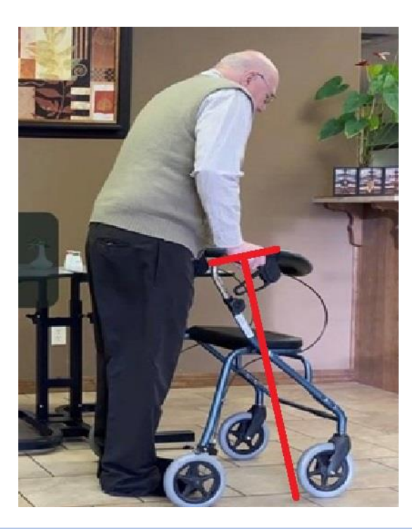
Photo 3: The attitude to get an good support is present and that means that the height of the handles is good. This upper trunk stand in flexion and give him the possibility to support on the right way on the handles. But the vector place the load between the wheels and that means that there is also load on the front wheels and that means that when he must turn, this isn't possible on his axis but he need an greater curve and that asked often for adaptation of the environment. When he want to sit on an chair, toilet, bed etc. better is than an possibility that he place his support on an fixed support point so that the combination support and steering isn't there. An fixed support-( par example an handle on the wall or stable table) -point makes often turning much more easier and therefore it is so important that this points are present and often isn't an "learning" training not necessary because people has done this often long before at their home and make sitting down and standing up easier.[16,17,18]