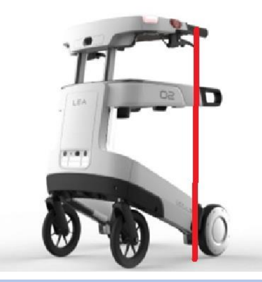
Photo 4: The Lea [23], an robot rollator frame that has multiple possibilities, especially the independent driving and the braking systems make driving and support different. That with the possibility that the tuning with support never has the result as the normal rollator will have. When turning must done with an large corner when the support is heavy and too far to the front wheels, will this devices be capable to hold the turn in the certain degree. There are an lot of other possibilities as instructions etc. but also the lower support can help with standing up because the brace works on for wheels and with the elbow on this support, we have an perfect Vorlage [24].

The effects of using and/or support of an rollator frame.