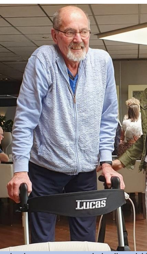
Photo 9: This attitude we see by many rollator users who place some support on the handles and this will have consequences for the shoulder joints. This joint isn't built for that amount of load and often is there an lot of correction necessary to get the rollator frame in the correct position. That part must often be done by the small muscles in the shoulder and the amount of load is often the reason for tendon problems [26]. But also is there damage through the impingement syndrome, through the upper trunk forward [15] is exorotation in the gleno-humeral joint restricted, that can give damage on structures in this area. [27,28] It is certainly important that therapist assess the shoulders of people that use rollator walkers, certainly when the use it to carry their load. Than is the danger great and is treatment often necessary to hold the shoulders in an optimal condition. Don't underestimated what an rollator walker can do to the shoulder joint and also an wrong type or handles that stand not on the right height.