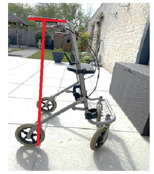
Photo 1: Wikepedia [11]: A walker (North American English) or walking frame (British English) is a device that gives support to maintain balance or stability while walking, most commonly due to age-related mobility disability, including frailty. Another common equivalent term for a walker is a Zimmer (frame), a genericized trademark from Zimmer Biomet, a major manufacturer of such devices and joint replacement parts. Walking frames have two front wheels, and there are also wheeled walkers available having three or four wheels, also known as rollators.

This pathological tone will decrease when people create an greater support area and have more control over their balance but this asked from all therapist that there is an good assessment why this extra aid is important and thus also knowledge which walking aid, but also the control, how this developed, is important so that people can hold their independency as long as possible.