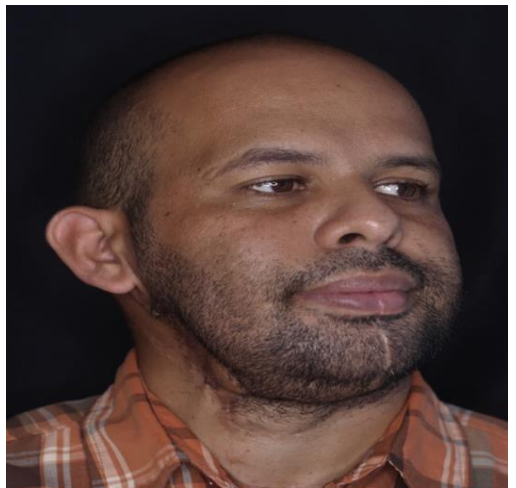
Figure 1: Preoperative Photograph.

subsequently infiltrate microfat with a 1.2mm diameter needle in the area of the mandibular body and cervical region on the right side. The procedure is carried out in one phase (Figure 2).