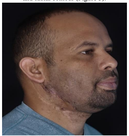
Figure 3: Postoperative Photograph

Controls are carried out 3 months, 6 months and 1 year after surgery where a lasting and aesthetic result is observed in the return of the mandibular and facial contour (Figure 3).