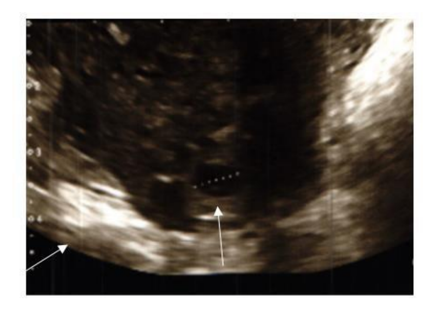
Figure 1: Ultrasound examination revealing a hematoma around the cornual region of the right fallopian tube.

The patient and her husband were explained the possibility of intra-abdominal bleeding and they agreed to the surgery. Emergency laparoscopy revealed a ruptured cornual pregnancy and surrounding hematoma (Figure. 2).