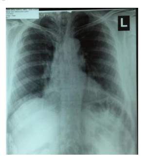
Figure 3: shows the x-ray of the same man on day five of follow-up.

consolidation. The laboratory tests of the same man on the third day of the beginning of symptoms were normal for cardiac enzymes, and lipid profile were normal. The ECG was normal at time of examination.