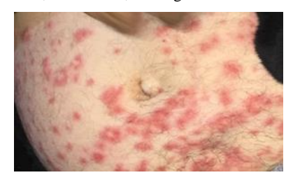
Figure 6: shows the dermatological picture of the abdomen of the same man on the third day of the beginning of symptoms.

There were non-specific, non-itchy, follicular erythematous papules. They varied in sizes and shapes, fading slowly on prednisolone in a gradual tapering schedule. Moreover, this rash distribution was in the abdomen, lower back, and legs.