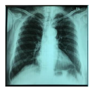
Figure 1: Chest x-ray of this man on the third day of the beginning of symptoms

The reader can notice there are minimal lung manifestations of early pneumonia. Consequently, these manifestations enclosed inadequately defined small centri-lobular nodules, bilateral non-symmetric ground-glass reticulo-nodular opacities, bronchial wall thickening, plus airspace