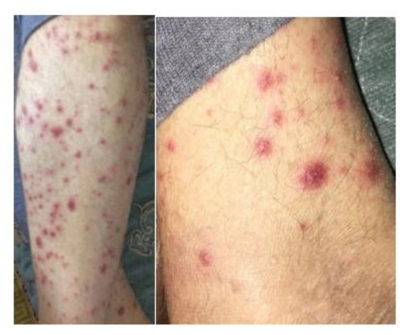
Figures 4, and Figure 5: The dermatological picture of the right leg, and right ankle for the same man on the third day of the beginning of symptoms.

The reader can notice new radiological manifestations incorporating an increment of pulmonary infiltrates, plus an increment of the thickening of bronchial walls, enlargement of the centrilobular nodules, plus an diffuse increment of the lung opacity.