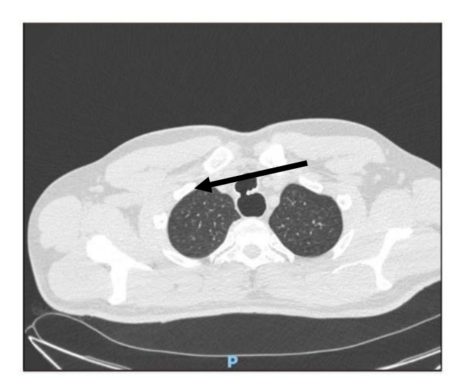
Figure 2: Computerised tomography (CT) scan of the neck and thorax with contrast. Of note there is a 6mm fistula between the trachea and oesophagus at the level of the second thoracic vertebral body (T2).

After discussion in the Upper Gastrointestinal (UGI) MDT, he was referred to the cardiothoracic and the ENT teams for consideration of tracheoesophageal fistula closure to avoid future aspiration pneumonia. Prior to the operation, he underwent a direct laryngobronchoscopy and