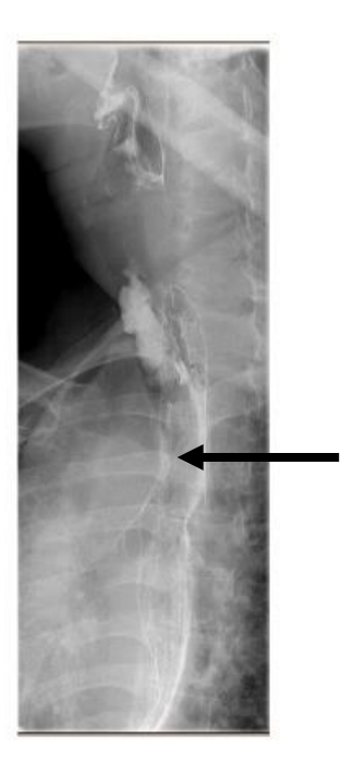
Figure 1: Barium contrast swallow images. Of note, there is evidence of contrast going into the left main bronchus and significant pooling in the trachea.

A computerised tomography (CT) scan of the neck and thorax with contrast revealed a small fistula measuring 6mm in diameter between the trachea and the oesophagus at the level of the second thoracic vertebral body (demonstrated by the arrow in Figure 2). Contrast was shown within