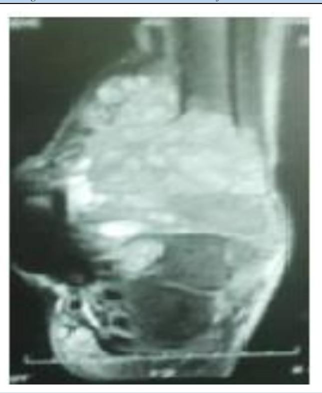
Figure 6: MRI Show heterogeneous lesion involve distal tibia and fibula with fatty infiltration and enhancement of blood vessel at medial site.