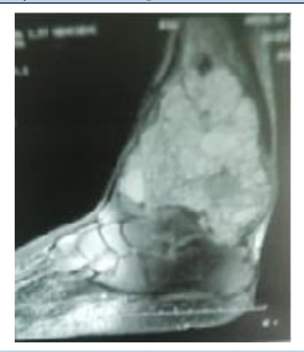
Figure 4: MRI Show heterogeneous lesion involve distal tibia and fibula.