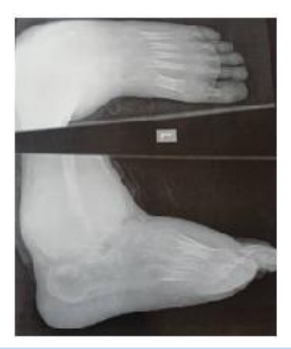
Figure1: X.ray Show lytic lesion in the cortical bone involve distal tibia and fibula with cortical break posteriomedially with blurred boundaries, extending into the soft tissue that is not limited by a bony shell; with destruction of the cortex, invasion of soft parts.

activity, but without atypical forms. The histological examination of the bone fragments confirmed a grade 3 giant cell tumor according to Sanerkin, Jaffe Lichtenstein and Pottis. CT scan was done to exclude pulmonary metastases (Figure 8). At three weeks removal of suture and start physiotherapy of knee. Surgical treatment with the excision of the large tumor mass by BKA improved the function of the leg and general condition of the patient.