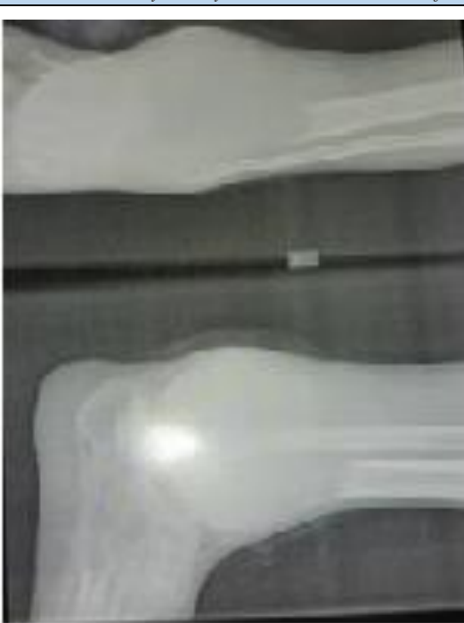
Figure 2: Show X.ray of lytic lesion in cortical bone involve distal tibia and fibula with cortical break posteri-omedially with blurred boundaries, extending into the soft tissue that is not limited by a bony shell; with destruction of the cortex, invasion of soft parts.