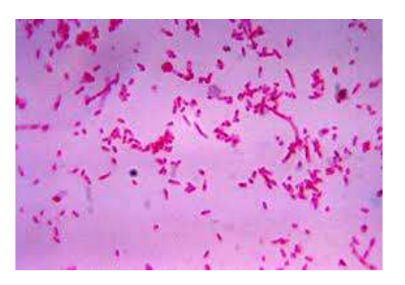
Figure 1: Gram staining of neck collection showing fusiform gram negative bacilli (Fusobacteriumnecrophorum)

growth of any organism.A neck ultrasoundwas performed, showingmultiple enlarged cervical lymph nodes, bilateral peritonsillar multiloculated enhancing fluid collections. It also showed punctate foci within the rightinternal jugular vein, which was thought to represent partialthrombosis. Surgical debridement was done and as wound swab gram stain showed Fusobacteriumnecrophorum , ananaerobic gram negative rod(figure 1), intravenous clindamycinwas added to meropenem.