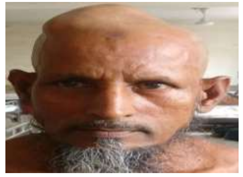
Figure 1: Scalp swelling about 8.6 x 6.5cm.

A 77 years male admitted to our department with complaints of gradual enlargement of a painless swelling on his vertex for one year. On examination we found a painless mass in left frontoparietal region measuring about 8.5 x 6.4 cm in diameter which was firm in consistency, not mobile, fixed with underlying & overlying structure, on general physical examination no other abnormality detected, neurological examination was also normal. He has no significant past medical or surgical illness. On MRI of brain revealed a iso to hypointense extra axial lesion involving the left frontoparietal region measuring about 8 x 6 cm causing mass effect over the brain parenchyma (Figure 1, 2, 3, 4).