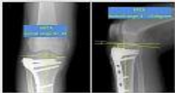
Figure 2 : Radiographic measurement of MPTA and PPTA and normal reference range [8].

MPTA is the medial angle between the tangential line and anatomical axis of the tibia in AP radiographs. (normal range: 82°-92°).