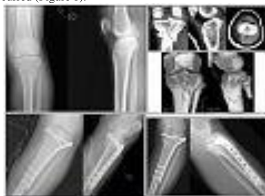
Figure 1 : Schatzker V fracture.