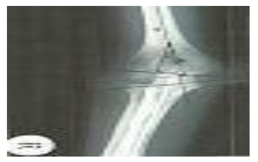
Figure 3 : Radiography of the elbow supracondylar fracture.

It gives the possibility to use the results of measurement of the TCI to determine better evaluation of treatment outcome of the fracture (Figure 3). The result of the present study can have implications on the general population of children with supracondylar fractures of the elbow because the sample population in this study is the same as in previous studies.