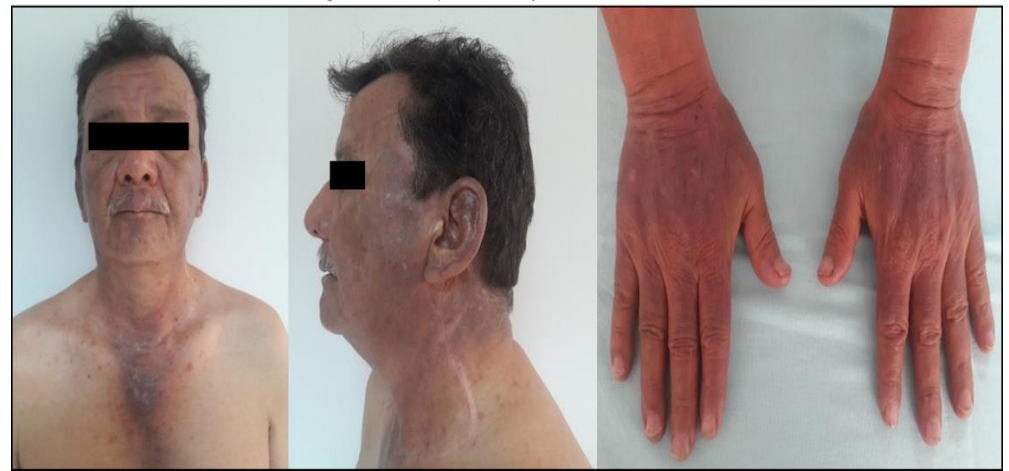
Figure 3. Patient 2 photosensitivity reaction with vandetanib