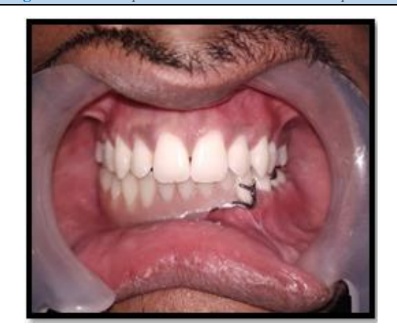
Figure 3A: Rehabilitation of edentulous space at 6 months post-operatively