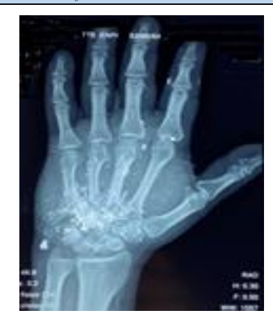
Figure 3: Mutifragmented fractures of the base of the 3rd, 4th, 5th metacarpals, large, hamate, pisiform of the left hand

Figure 2: Outlet path with lesion in left hand extensor zone VI causing skin defect of 4cm x 3cm