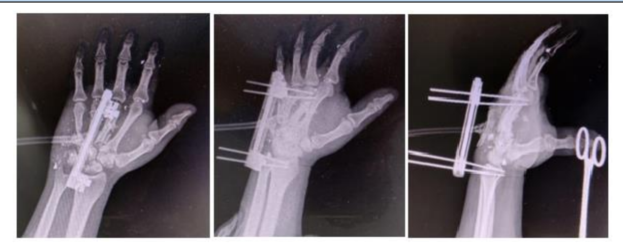
Figure 5: AP , oblique and lateral X-ray control of the 9.5 cm external fixator in the head of the 3rd metacarpal to the distal radius of the left hand