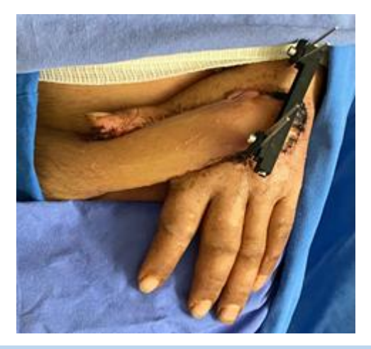
Figure 7: Coverage of the skin defect with a left inguinal fasciocutaneous flap