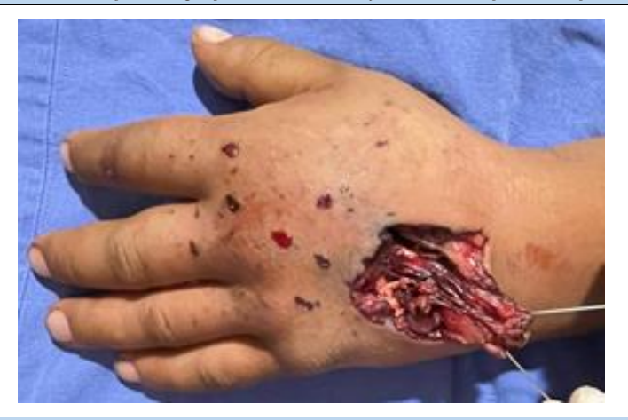
Figure 2: Outlet path with lesion in left hand extensor zone VI causing skin defect of 4cm x 3cm