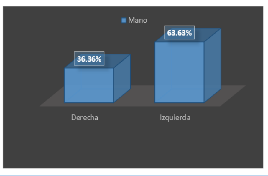
Table 1: Injured hand