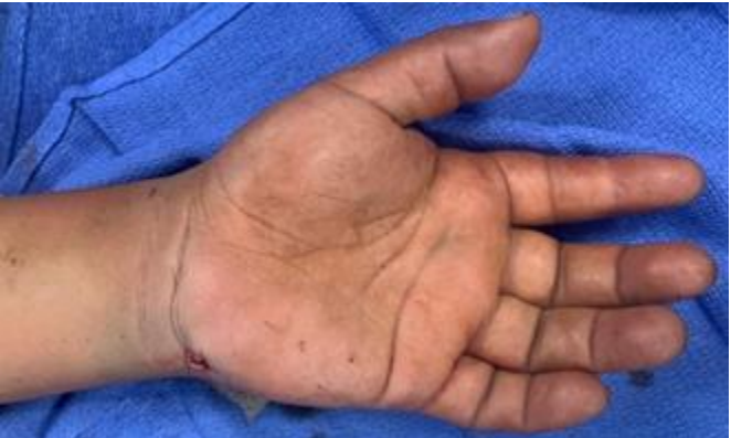
Figure 1: 8mm x 6mm firearm projectile wound entry hole in the left hand in flexor zone IV

Injuries caused by HPAF present multiple variables in terms of their production or ballistics mechanism, the site of the injury, the anatomical regions affected, the degrees of injury produced and the evolution that the affected organs may have. The amount of kinetic energy transferred from the projectile to surrounding tissues, internal organs and directly damaged structures, as well as the final location of the projectile, determines the severity of gunshot projectile wounds.1 These injuries are complex due to their proximity neurovascular structures and the concurrent participation of various tissues (tendinous, bone or nerve) 3; which require complex and meticulously planned treatments.