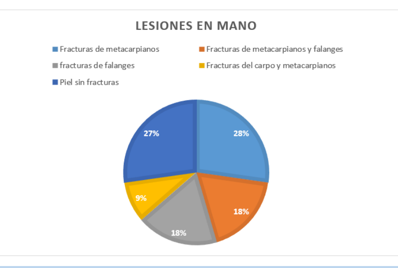
Graph 3: Hand injuries due to projectile wounds from a firearm