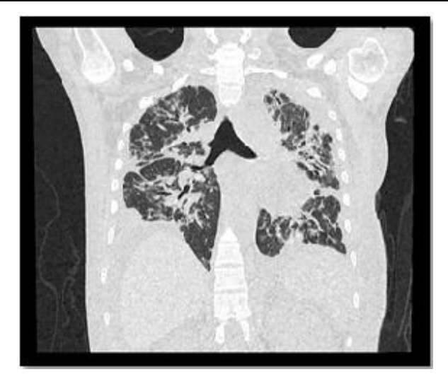
Figure 2: Thoracic CT scan without contrast