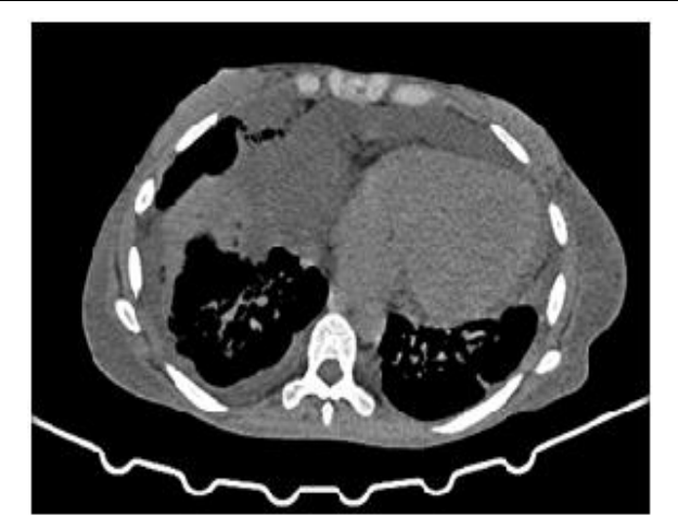
Figure 3: Abdominal CT scan without contrast