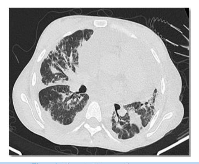
Figure 1: Thoracic CT scan without contrast