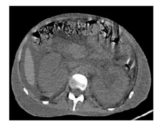
Figure 5: Abdominal CT scan without contrast