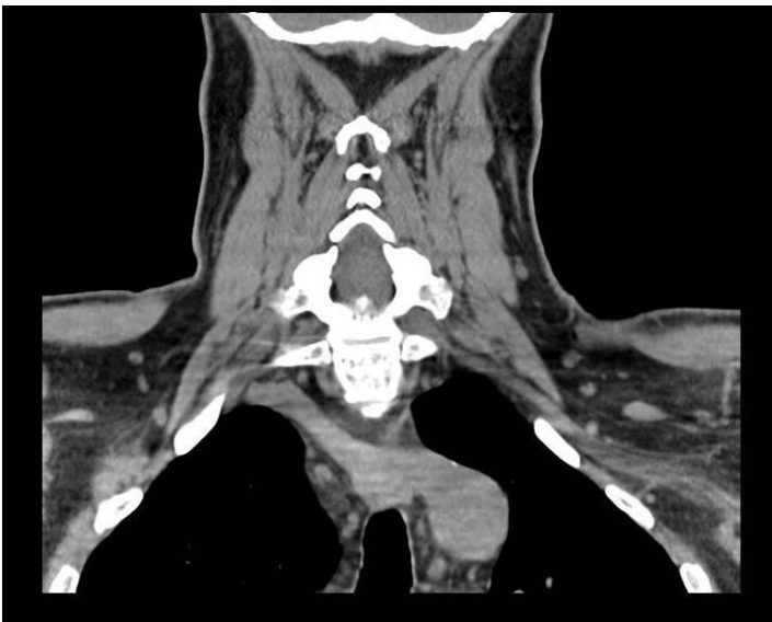
Figure 3. Pre-surgery CT scan highlights an aberrant right subclavian artery (see arrow).