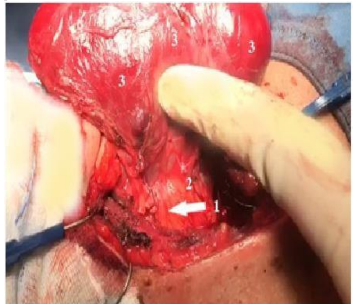
Figure 1. The right nonrecurrent laryngeal nerve (NRLN) runs in a single trunk and it is parallel to the inferior thyroid artery (1. Right NRLN; 2. Trachea; 3. Right thyroid lobe).

We obviously were prepared for the occurrence of a NRLN, as the patient performed a CT