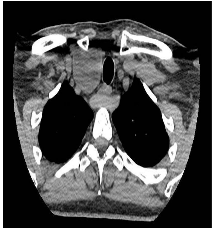
Figure 4. Pre-surgery CT scan: arteria lusoria has a retrosophageal course (1. Arteria lusoria, 2. Esophagus, 3. Trachea).

However, we had never previously found a NRLN during other surgical procedures. This anatomical variant evoked surprise and concern, as this time we did not know for sure the course of the ILN and we did not know if it presented as a single-trunk or with a multiple-branched course. In fact NRLN is a rare presentation, but the risk of intraoperative damage can reach 12.9% [2].