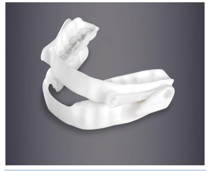
Figure 1. Narval® OA

All patients were carriers of a Narval ® Computer-Aided Design and Computer-Aided Manufacturing OA, manufactured by Resmed Laboratory (Saint Genis Laval, France). It is a custom-made bibloc-type OA made of semi-rigid gutters articulated by a system of triangles and connectors for titration ( Figure 1 ).