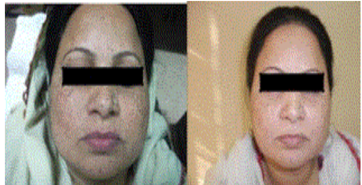
Figure 1 Maxi tech is intensive peeling.