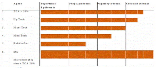
Chart 1 Depth of destruction of various peeling agents/p>

This is a prospective study in which fifty four patients were treated, out of which 34 patients were treated with combined chemical peel treatment and eight patients were treated with chemical peel and IPL microdermabrasion. Although statistical analysis show the comparison between these two groups is non-significant (p value 0.106), however, clinically satisfactory results achieved in the second group of patients. In our office setting practice, we perform approximately four sessions weekly of chemical peel and continue skin lightening/spot protection creams and sun protection. The results achieved are highly satisfactory (80% to 90%) for almost all skin conditions treated.