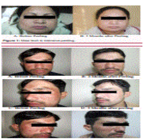
Figure 2 Mini tech is a soft peeling continuous and noninvasive cutaneous renewal.