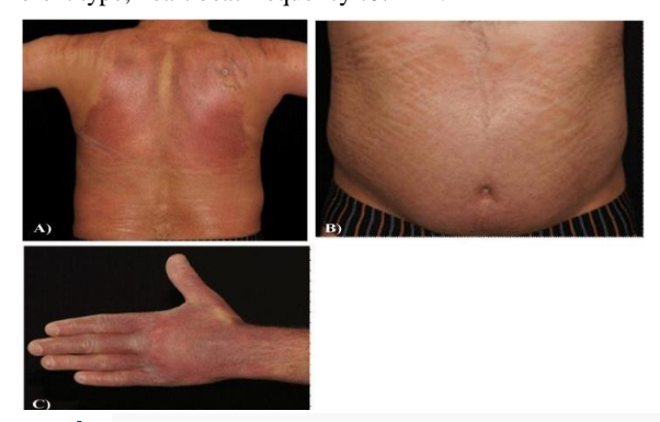
Figure 1: Cutaneous manifestations of ACA in our patient. (a) Lividerythematous symmetric fibrosclerotic plaques. (b) Brownish hyperpigmentation along tensions lines. (c) Acrocyanosis of the hands.

Ultrasound - neck, axillaries, groins, abdomen - unremarkable. Thoracic X-ray and body plethysmography - unremarkable. Electrocardiography: indifferent type, heart beat frequency 79/ min.