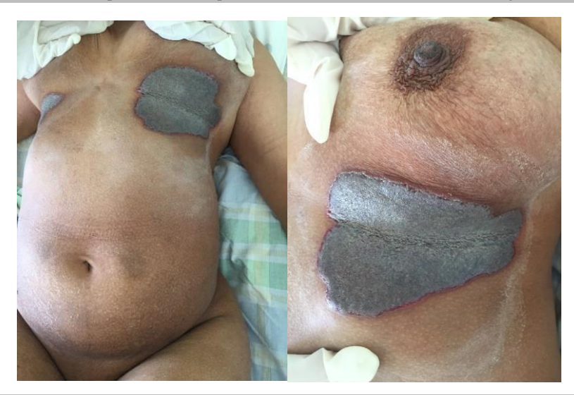
Figure 3: Well limited erosive plaques of variable size with papillomatous vegetative surface at the level of the breast folds.

Figure 2: Affection of the big toe of the right foot (A) and the first 4 toes of the left foot (B), seat of a vegetative erosive plaques surmounted by pustules with exposure of the matrix nail in the affected fingernails.