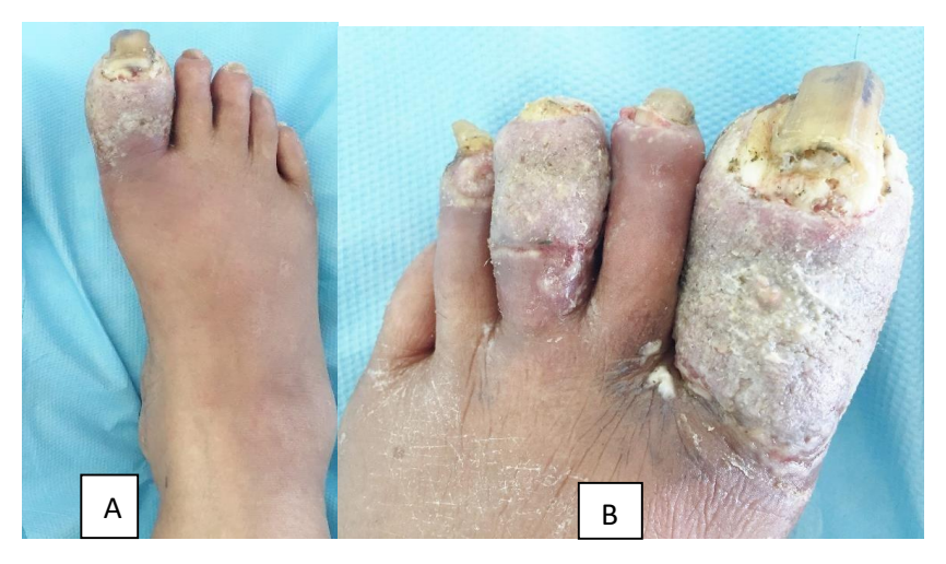
Figure 2: Affection of the big toe of the right foot (A) and the first 4 toes of the left foot (B), seat of a vegetative erosive plaques surmounted by pustules with exposure of the matrix nail in the affected fingernails.

Figure 1: Eroded, swollen plaques taking the anterior (A) and posterior (B) sides of the right thumb with a vegetative surface, with pus from pressure.