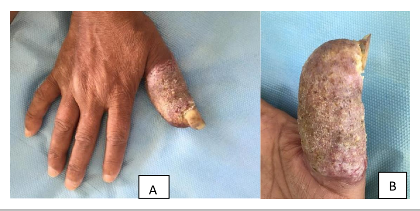
Figure 1: Eroded, swollen plaques taking the anterior (A) and posterior (B) sides of the right thumb with a vegetative surface, with pus from pressure.