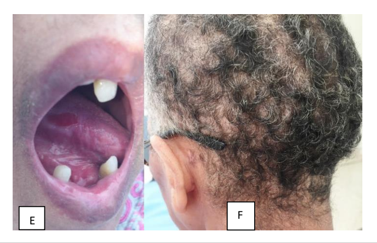
Figure 7: Clinical improvement of lesions of the thumb (A) of the toes (B) of the sub-mammary fold (C) of the genital area (D) of the oral mucosa (E) and the scalp (F) after 1 month of treatment.