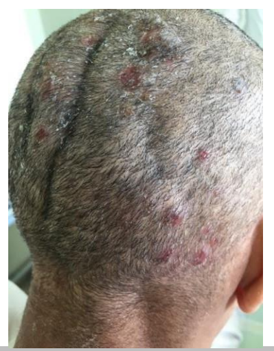
Figure 6: Presence of a cutis gyrata on the scalp with multiple erosions topped by meliceric crusts with pus.