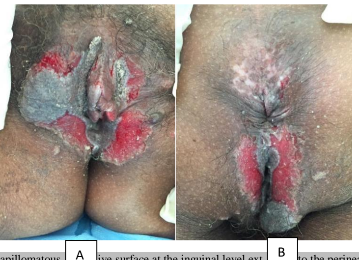
Figure 4: Erosive plaques with papillomatous A ive surface at the inguinal level ext B to the perineal region (A) arriving to the anal region (B).