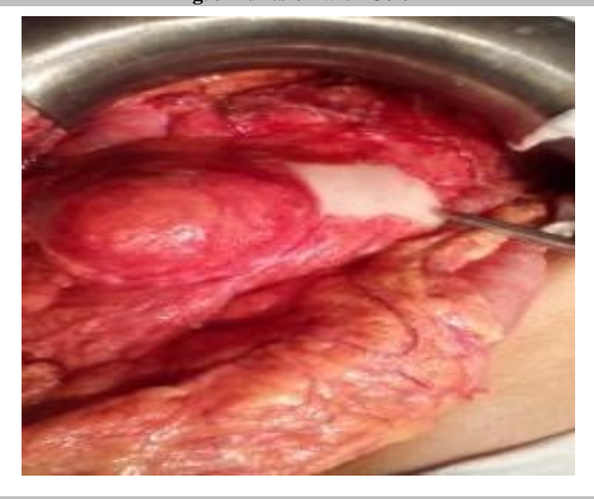
Fig. 4 Adhesions with Diaphragm