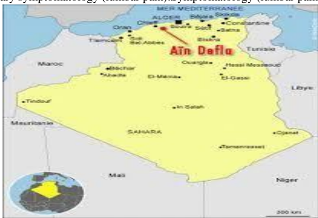
Fig. 1 (Map).

We report below the case of a 28 year old male; originally from Ain Defla (Fig. 1) and living there, without any particular history; in whom the discovery of this pathology was fortuitous during the exploration of a urinary symptomatology (lumbar pain). Symptomatology (lumbar pain).