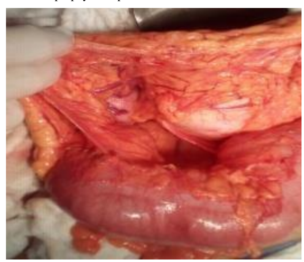
Fig. 3 Adhesion with Colon

Total removal of the cyst with the spleen Fig.7. The postoperative period was uneventful and the patient was discharged on the postoperative day 7. The clinical and ultrasonography follow-up did not show any evidence of recurrence at six months. After the splenectomy, the patient was given prophylactic vaccination (Streptococcus pneumoniae, Haemophilus influenza type b and Neisseria meningitidis,) and was started on a sixmonth course of prophylactic penicillin.