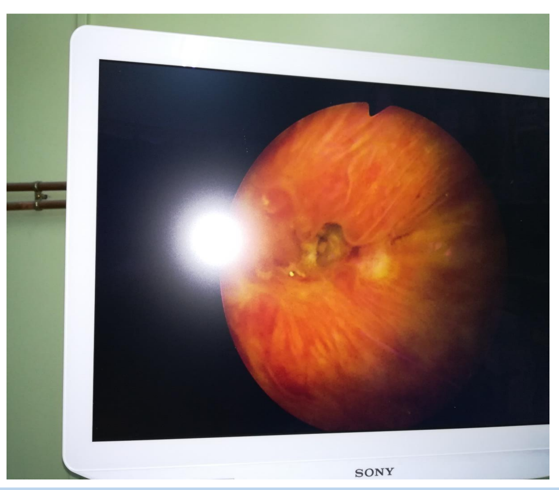
Figure I. Cystoscopic depiction of vesicovaginal fistula. Postoperative week.

Assiduous Cystoscopy coagulation completed successfully transformation of the pathologic area into fibrous connective tissue (Figure II.).