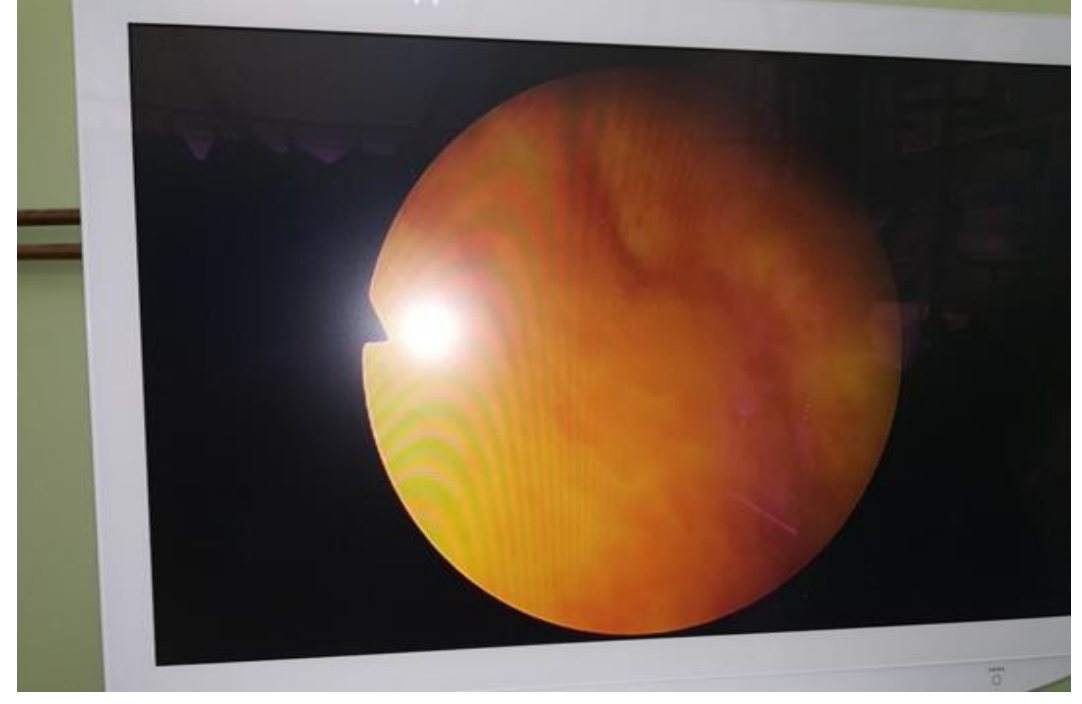
Figure II. Cystoscopic depiction of vesicovaginal fistula. One month later.

Assiduous Cystoscopy coagulation completed successfully transformation of the pathologic area into fibrous connective tissue (Figure II.).