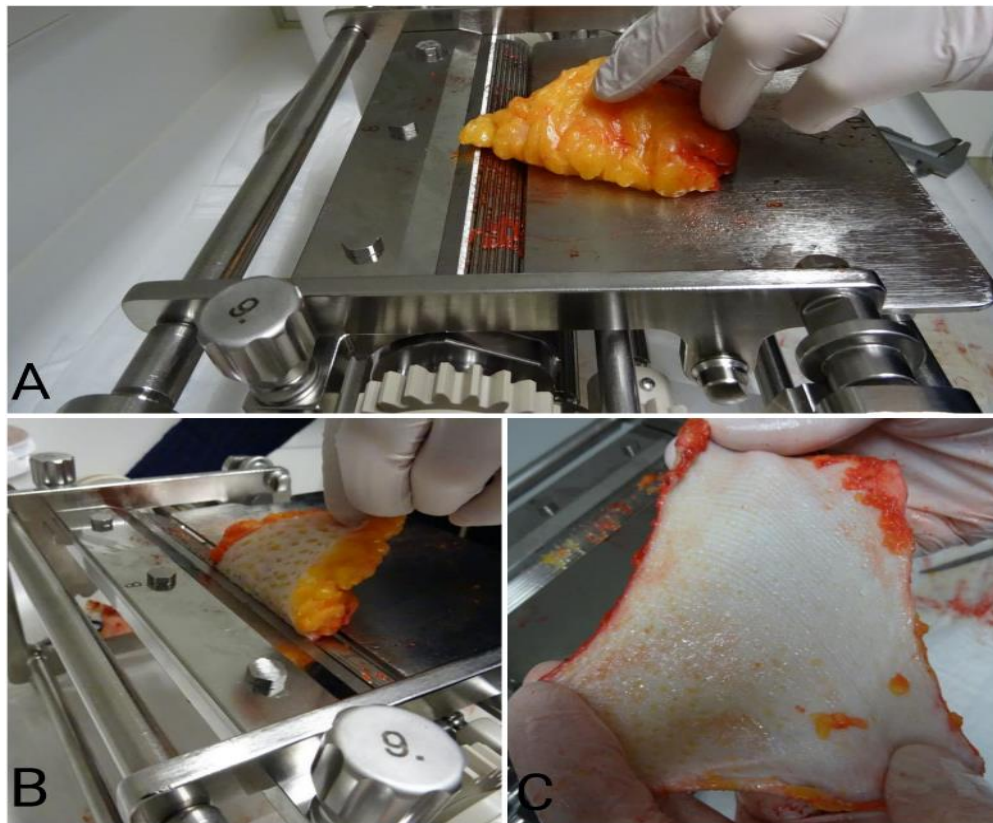
Figure 1: The upper subcutaneous tissue should be guided straight in the direction of movement at an angle of approx. 45° during cranking with very minimal uniform tension (A-C).