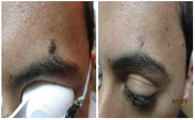
(A: Before) (B: After)