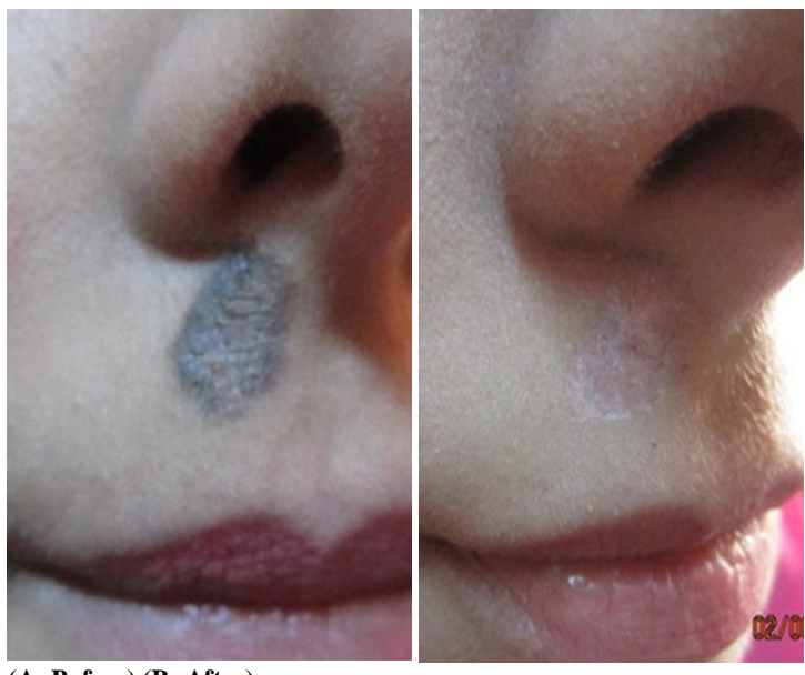
(A: Before) (B: After)