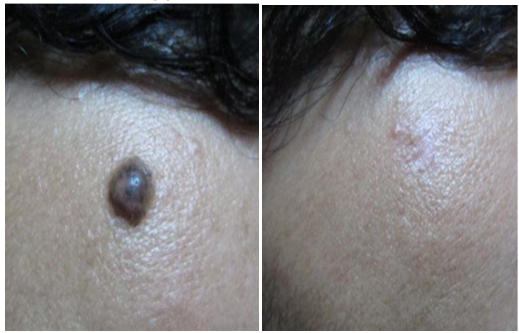
(A: Before) (B: After)