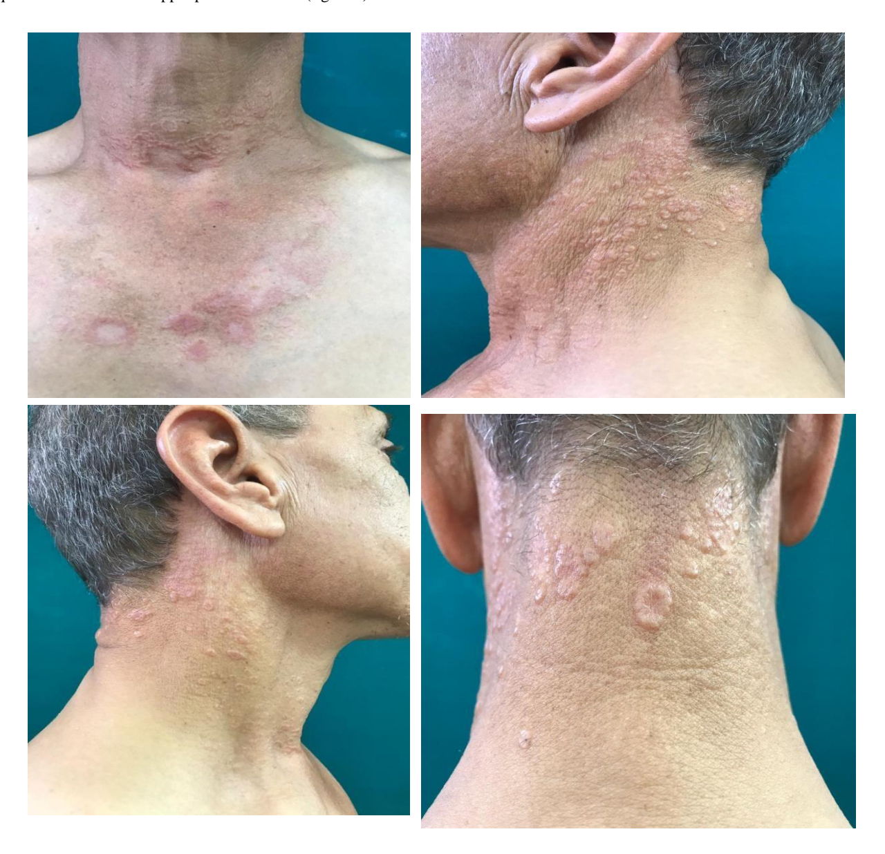
Figure 2: multiple papules and annular plaques over the neck and upper chest.

Another lesions of different morphology composed of flesh-colored to erythematous papules, some of them are discrete and others are coalescing into annular plaques over the neck and upper part of the chest (figure 2).