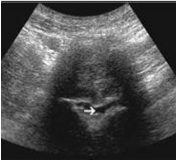
Figure 1. The expressed stenosis of the vertebral canal at the level of L4-L5 is due to circular hernia.