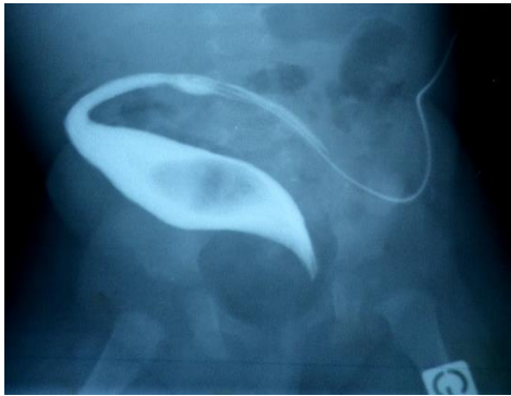
Figure 2. Distal colography showing the imprint of the mass on the rectal pouch end.

During posterior sagittal anorectoplasty (PSARP) using Peña technique, the rectal pouch end, could not be exposed. Which brought us to do, a reconstruction of the sphincter muscular complex on a tracheal tube. A complementary abdominal approach was performed and permitted the discovery and resection of a presacral mass (Figure 3). The rectal pouch end found was then lowered using the tracheal tube as a tutor [10]. Restoration of colonic continuity was performed at the same time to allow sufficient colonic length for the lowering. After the PSARP, the perineum was put to rest without tension on the sutures, by placing a plaster at the level of the two joined legs. Anal dilatation started as soon as the perineal surgical wound was healed on the 21 st day and was performed using Hégar dilatator. The dilatation sessions were, among other things, a training in defecation. Expulsion of the lubricated dilatator introduced into the anal canal, was made possible by the contractile force of the musculo-sphincteric complex. The immediate post-operative follows up was simple.