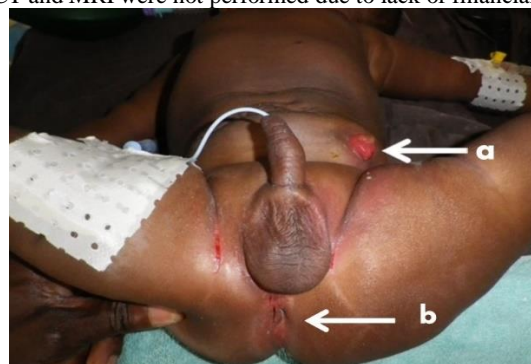
Figure 1. Anorectal malformation without fistula (a: colostomy. b: presumed area of the anus)

an uneventful follow up and the child was discharged. At 7 months of age, as part of the paraclinical explorations for anorectoplasty, a distal colostogram (Figure 2) performed, revealed a semi-lunar image veiling the sacrum and making a presumptive mass effect on the rectal pouch end. Pelvic CT and MRI were not performed due to lack of financial means.