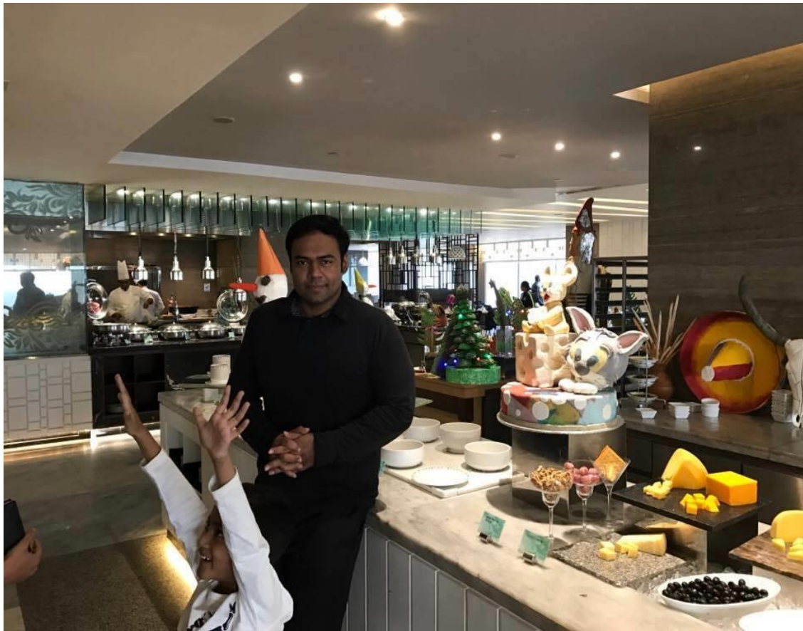
Figure 2. The Author