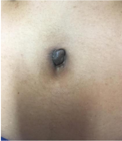
Fig 1: Blackish-brown umbilical nodule with light brown area around.