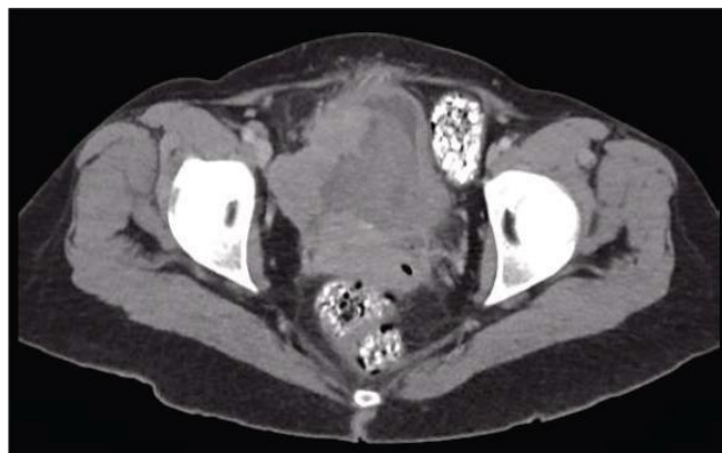
CT scan axial view of right sided bladder mass prior to TURBT.

Other staging investigations including CT chest and whole body bone scintigraphy showed no evidence of distant metastasis. No staging positron emission tomography (PET) scan was ordered at this time. Due to an uncertain initial diagnosis and the prospect of gynecological malignancy, tumor markers to evaluate a pelvic mass had already been ordered and revealed a CA19-9 of 53 kU/L (Reference range 0-35 kU/L), and bHCG of 5 U/L (Reference range 0-2 U/L). Other markers including alpha fetoprotein (AFP) (3.8 ug/L; Reference range 0-10 ug/L) were within normal range.