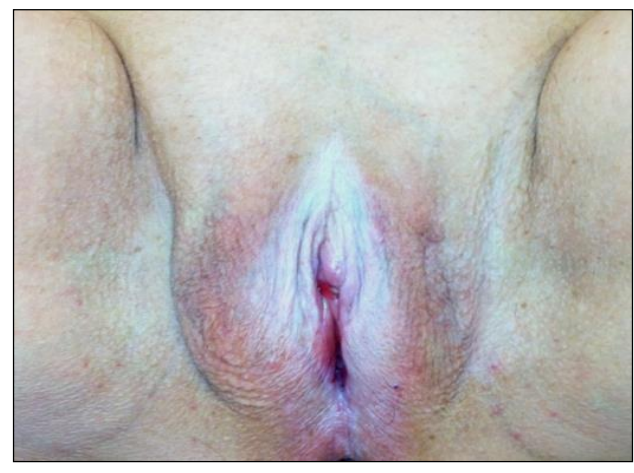
Figure 2: Carcinoma in situ on the background of diffuse sclerotic zoster, and vulvar dysplasia, passing on the skin of the thigh (Patient C., 62

As noted by the women themselves after PDT was only a temporary subjective effect, after which the itching resumed and they resorted to various folk remedies