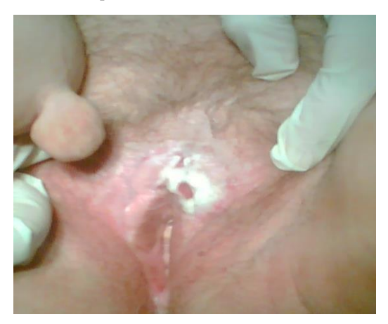
Figure 1: Patient K., 76 years old. D-z: Cancer of the vulva (T1NoMo) in the area of the clitoris on the background of sclerotic lichen. Soft fibroma of the skin of the inner thigh.

The examination we carried out with the use of colposcope (15 fold increase), allowing a high degree of confidence to select sites for target biopsy. Given the multicentric growth, as a rule, morphological study of vulvar dystrophies started with obtaining cytological material (smears and scrapings) from the suspicious areas ( Figure 1 ).