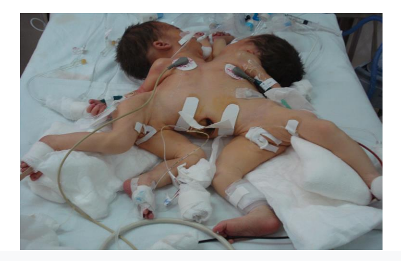
Figure 1: Toracoomphalopagus conjoined twins the first day of life.

After birth, a brain ultrasound was performed on both girls, which was normal. Echocardiography showed a single pericardial cavity with two hearts in it, without being able to define whether or not they shared ventricular myocardial wall. Abdominal ultrasound observed 4 kidneys, 2 bladders and one liver fused in the midline that passed from one girl to the other. Two hepatic pedicles were identified in the liver, each consisting of a normal bile duct, hepatic artery, and portal vein. Two suprahepatic venous drainage systems were also observed.