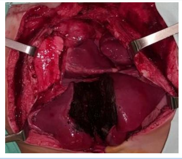
Figure 4: Both hearts into a single pericardium, and liver sectioned surface.

Skin flaps were designed and tisuue expanders were removed. A longitudinal skin incision advancing over expanded tissue and a median laparotomy up to the umbilicus, sectioning it in its midline, were performed. The sternum was identified and was sectioned through the midline. Both pleural cavities were opened and phrenic nerves identified. The thymus was dissected free and the single pericardial cavity was incised, observing complete separation of both hearts. The diaphragm and posterior surface of the pericardium were dissected and sectioned. Both hepatic hila were identified and the liver was sectioned using electrocautery and ultrasonic sealer (Focus®). Hemostasis of liver surface was done with argon gas (Force Fx, Medtronic®). The other sternum (posterior) was incised and then posterior soft tissues were sectioned (Figure 4).