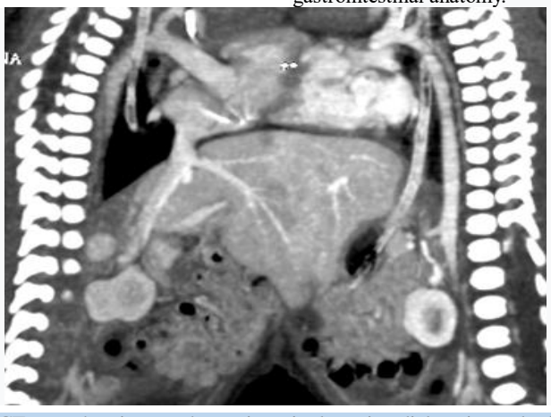
Figure 2: CT scan showing two hearts in a single pericardial cavity and a fused liver.

Computed tomography angiogram scan (Figure 2) showed a single pericardial cavity, with two hearts inside. From each heart an aorta emerged that supplied the rest of the body of each twin, and the venous return was effected through a vena cava for each girl. The liver fused in the midline with two independent vascular and biliary pedicles. Four kidneys forming two independent urinary systems. Each sister had a separate digestive system (esophagus, stomach, small and large intestine). Barium contrast study through a nasogastric tube was performed to verify gastrointestinal anatomy.