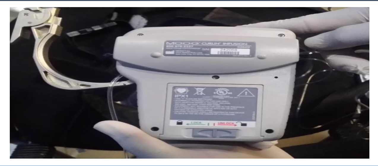
Figure 5: Dobutamine infusion machine