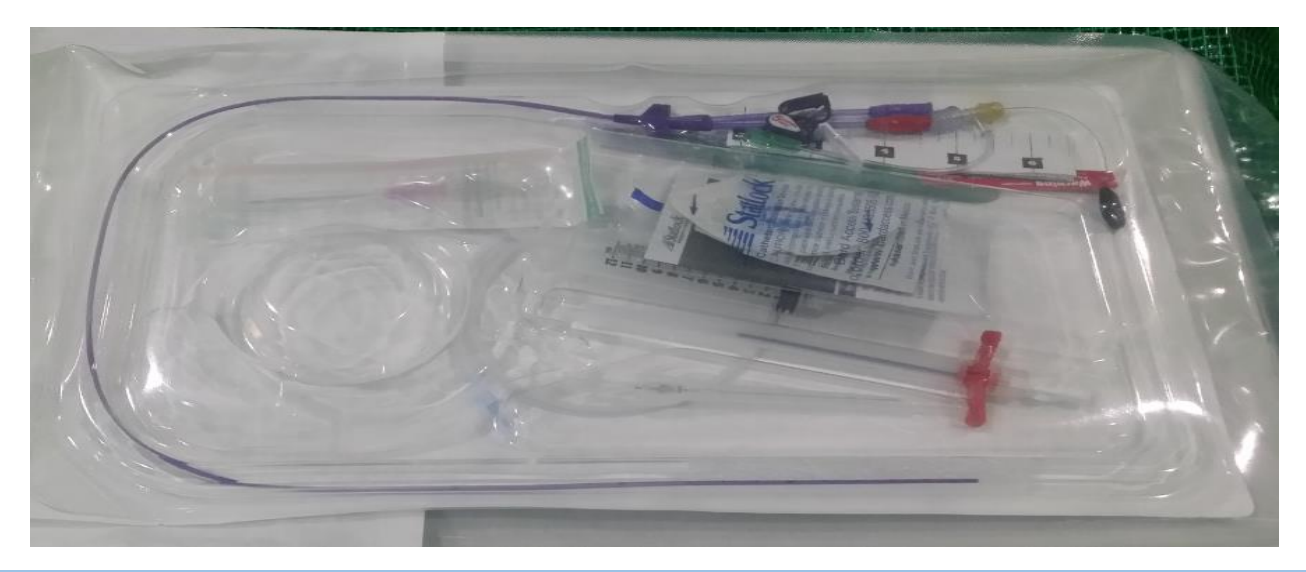
Figure 1: two way pink peripheral line set

Dobutamine (8 mcg/kg/min), sub-cutaneous clexane (0.4mls), and digoxin (0.125 mg) daily were initially commenced. The blood pressure improved and sustained in the ranged of systolic (120-130mmHg) and diastolic (80-90mmHg) on dobutamine. Furosemide 80 mg twice daily was added to the treatment when his blood pressure improved. Dobutamine was later maintained at a dose of 5 \mu g/kg/minute, with improvement in cardiac output and consequent diuresis. Any attempt to wean him off dobutamine, his clinical condition worsened. He continued on infusion rate with the diluted drug in a dose of 2000 mg in 500 mls of 5% Dextrose water and run 125mls per day at a rate of 5 drops per minute from Moog Curlin infusion Pump (Curlin Medical) via a Bard pink peripheral venous line with an inline bacterial filter ( Figures 1,2,3,4.5 ). He was discharged self-caring with help from his general practitioner and