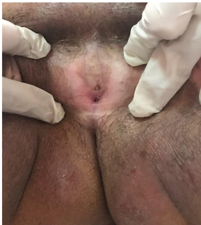
Figure 1: Aspect of the urethral meatus

After discussion with the patient and her sensitization on the fact of coming consulted at the slightest finding of a decrease of the urinary flow for dilations, and that in case of a recurrence urethroplasty will be proposed. Since then, the patient is easily urinating and satisfied.