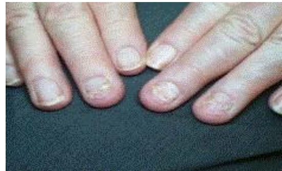
Figure 1 Nails prior to treatment.

This patient did not want the risk of oral therapy; therefore, laser therapy was an excellent option with little to no side effects. The laser was set at fluence 16J/cm 2 , pulse duration 0.2m sec and repetition rate 3.0 Hz. Each fingernail received 200 pulses, the thumb received 100 pulses, and the fifth fingernail received 50 pulses. Excellent clinical results were noted after 4 weeks (Figure 3). The patient remains in remission to date (24 months).