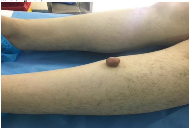
Figure1: Clinical image: brown exophytic mass measuring 4cm

We report a case of 35 years-old patient, with no pathological history. She presented to our institution with a slowly growing mass on her left leg back for seven years. The mass would recur and progressively enlarge each time. Clinical examination showed a brown exophytic mass measuring 4cm, that was extremely firm on palpation and not freely movable (Figure1).